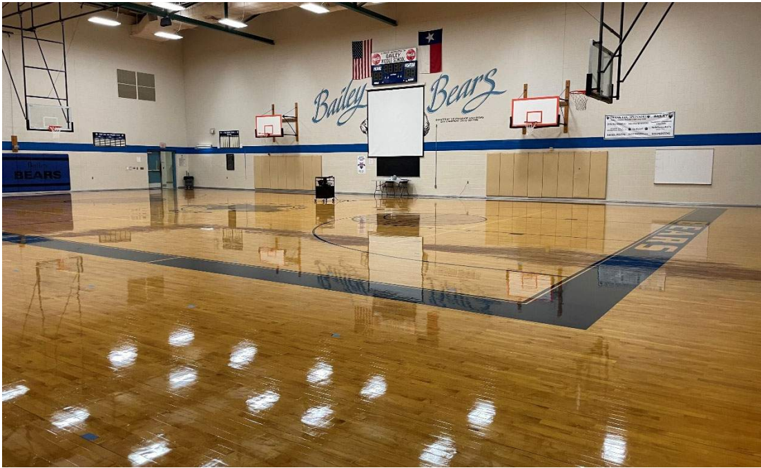
The gym is large and functions well but needs updates to finishes.