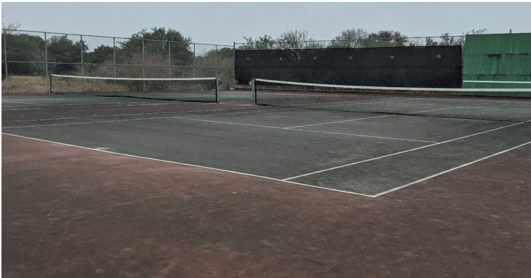
Tennis courts are in disrepair.