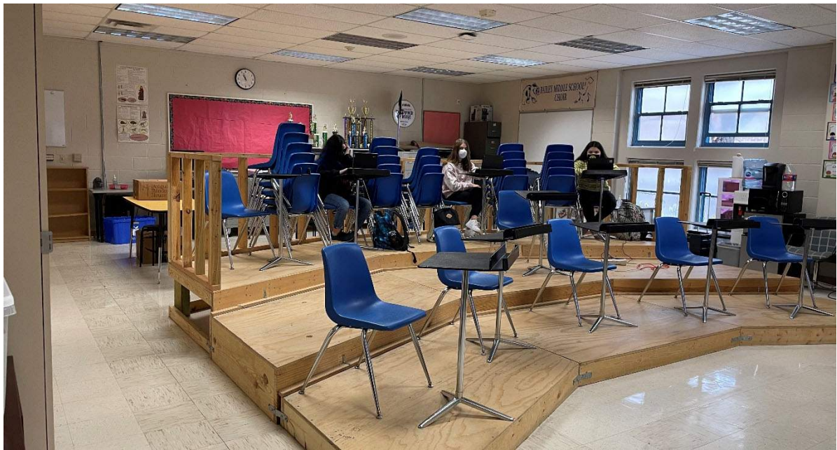
Choir facilities are makeshift and not suitable for the program.