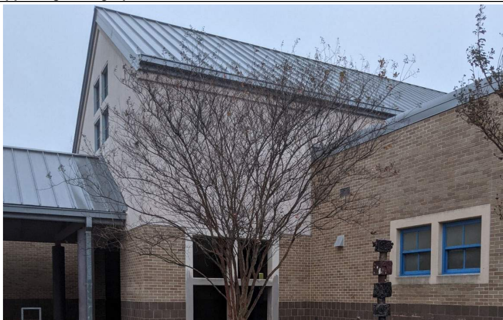
Attractive and well-maintained building exterior.