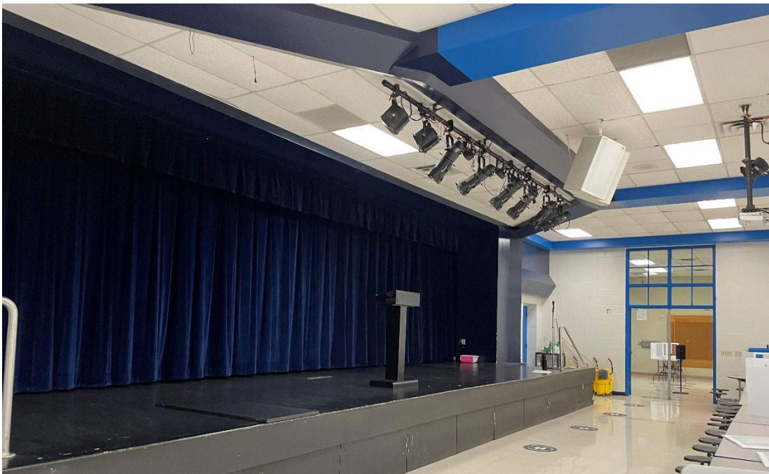
There is a large stage and generous cafeteria seating.