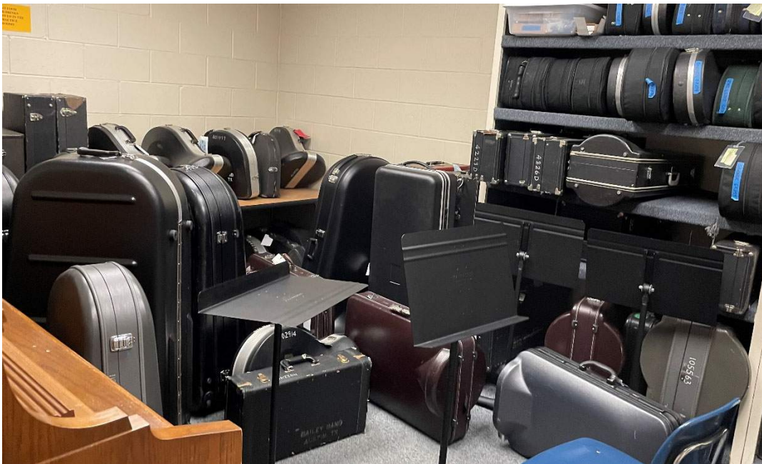
Storage is lacking in many spaces throughout the school.