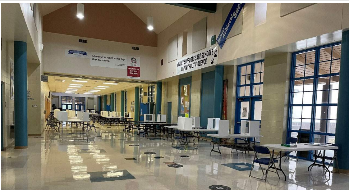
Large commons area serves as a reception space during school and for after-hours programming.