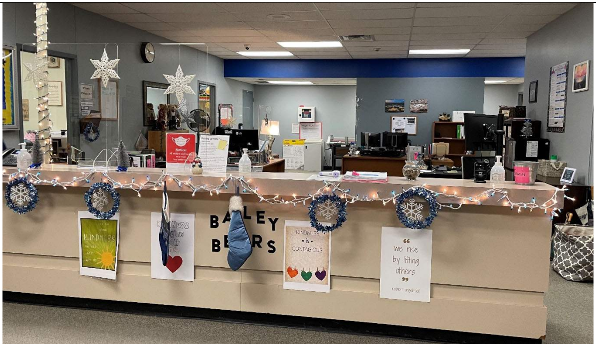
The administrative suite is well-sized but could benefit from updated finishes.