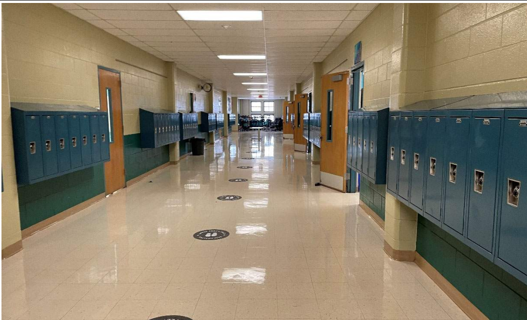
Generous corridors could be reconfigured for flexible, independent learning.