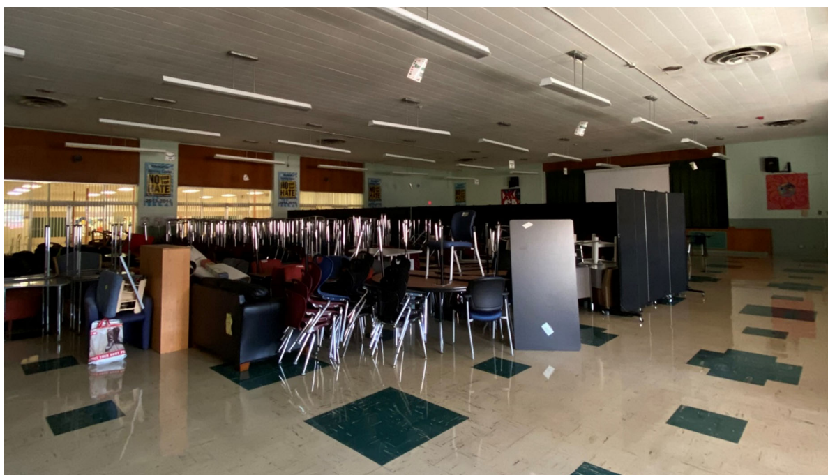
Cafeteria is adequately sized with good natural light. At time of assessment, this area was being partially used as furniture storage due to COVID-19 protocols.