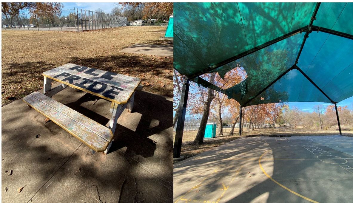
Outdoor furniture and shade structure in poor condition.