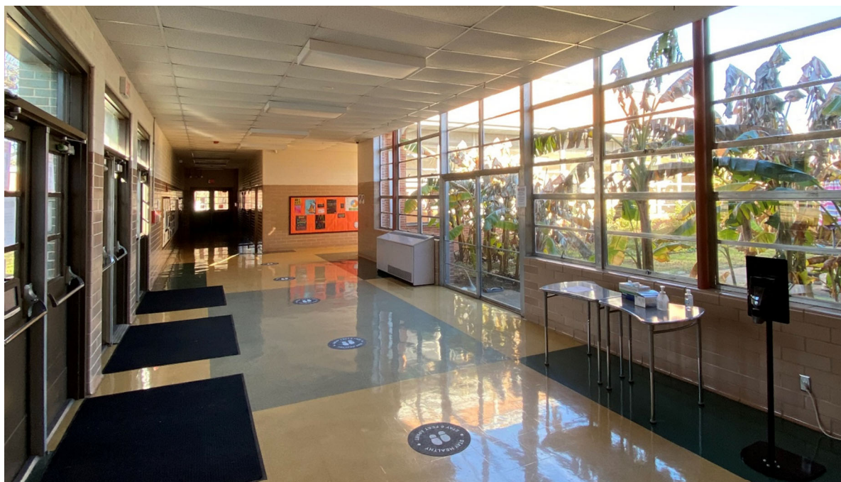
Planted courtyard at main entry.