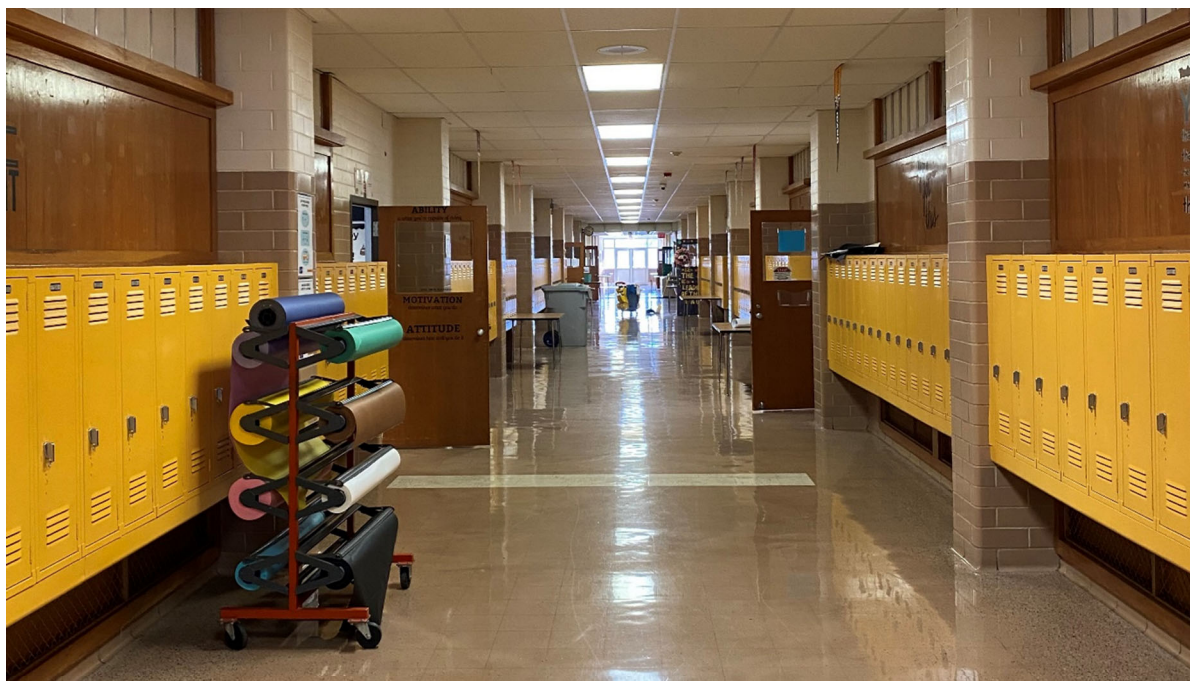
Typical Corridor: Spacious corridor with lockers.