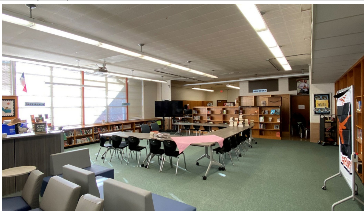
Media Resources: Good variety of flexible furniture.