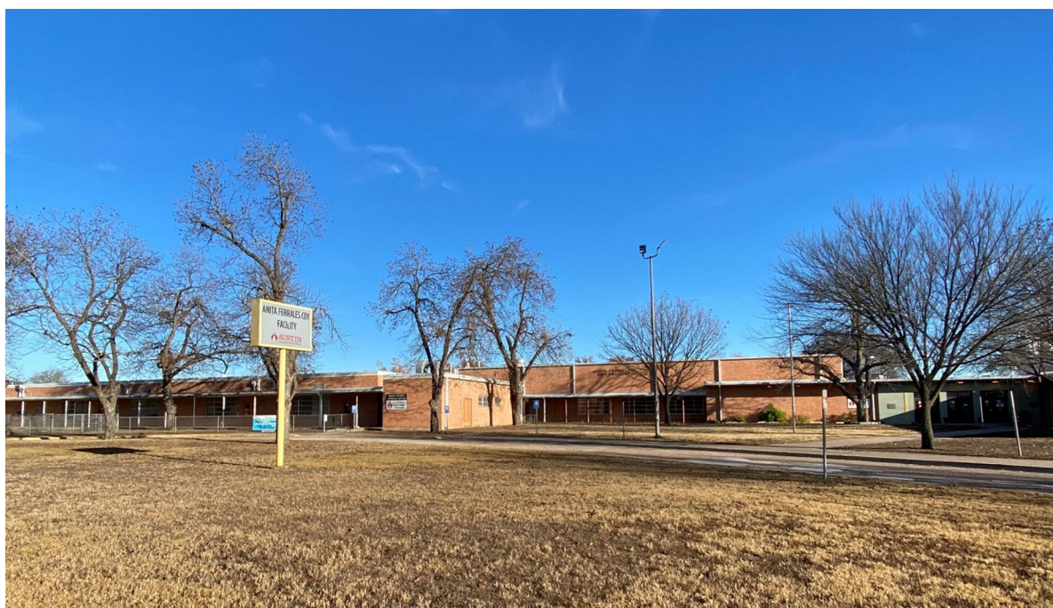
Small monument sign and building signage is difficult to read.