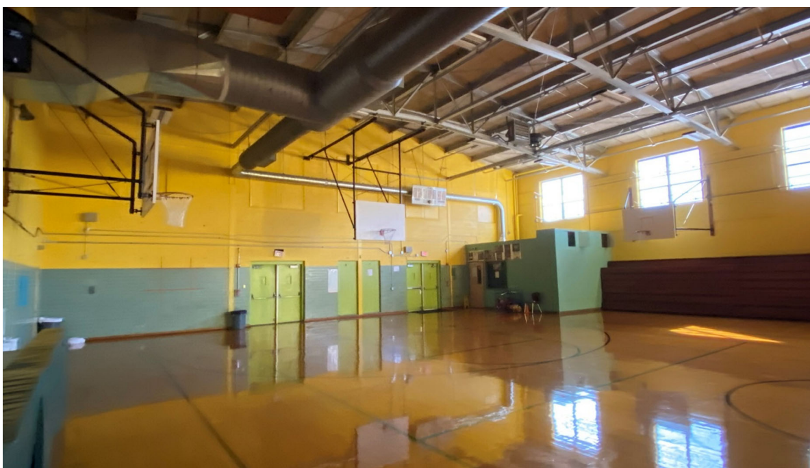
Gym is original to school and has not been updated.