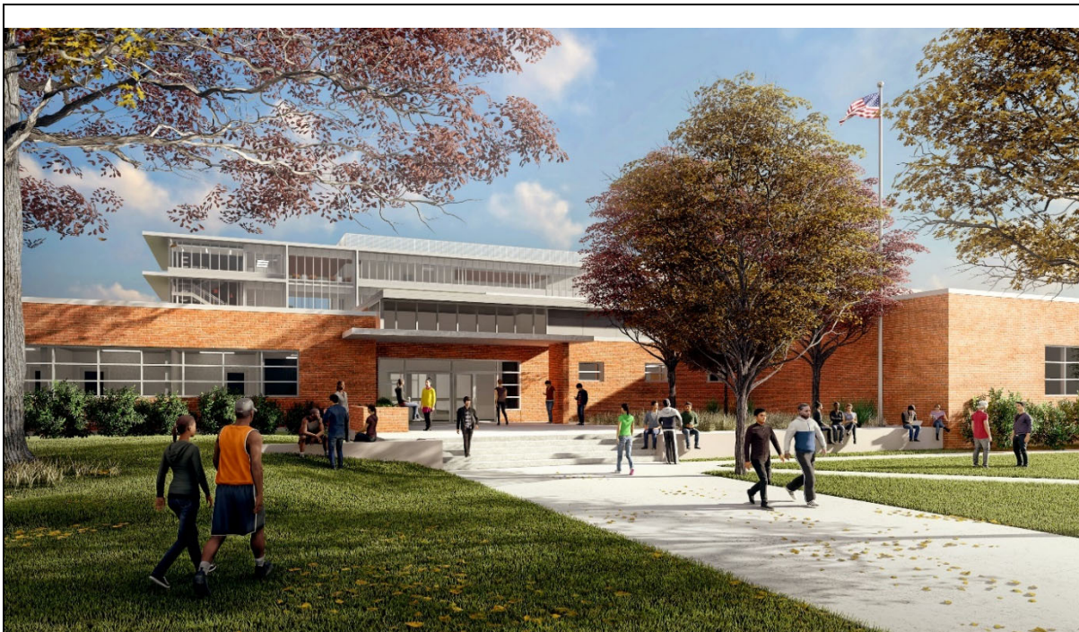
Historic Entry located off of Thompson Street