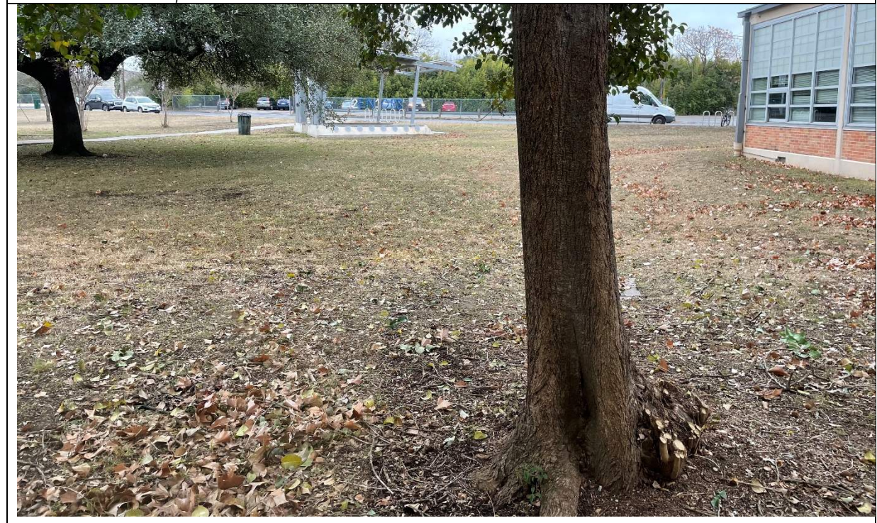
Outdoor solar studio.