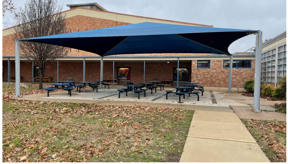
Outdoor Studio: Generous size and well shaded. Furniture not flexible, no visual display board.