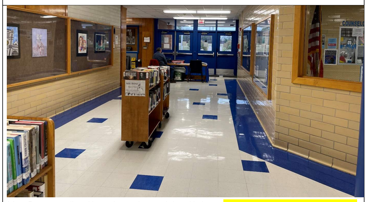
Main Entry is small and has a low ceiling and dated lighting.