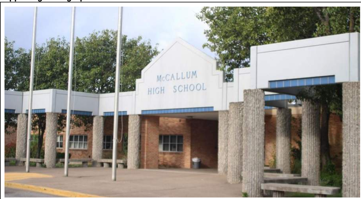
Exterior of school is dated, but in good condition.