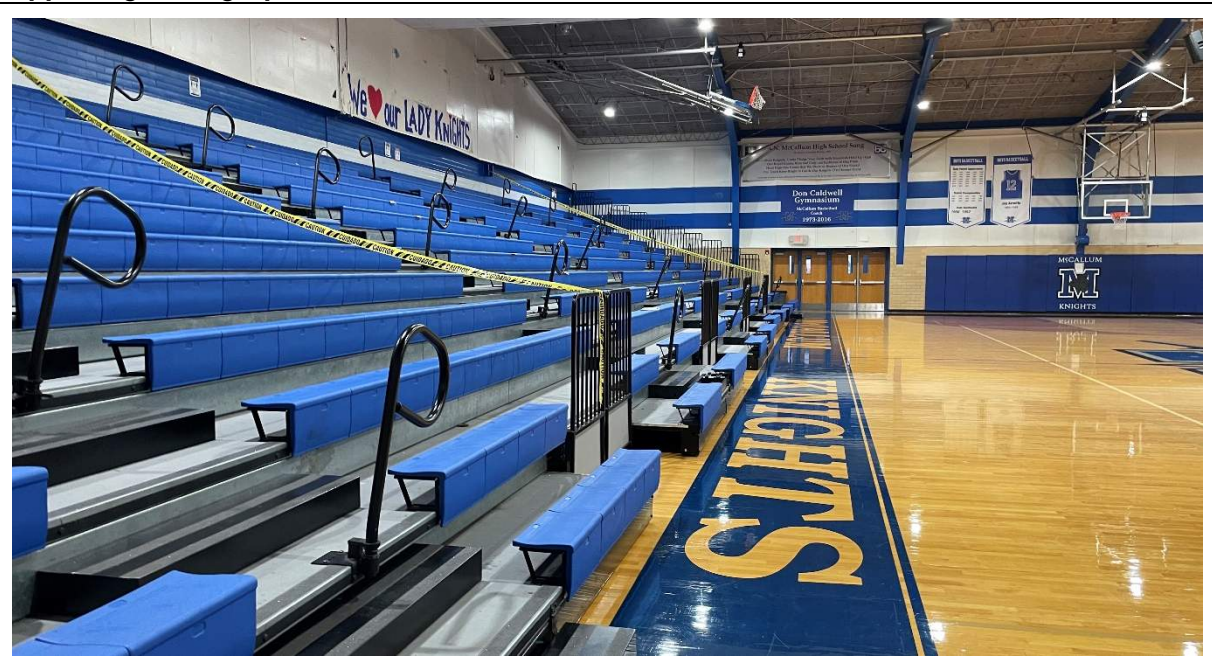
Competition Gym: Spectator bleachers located on one side of gym only.