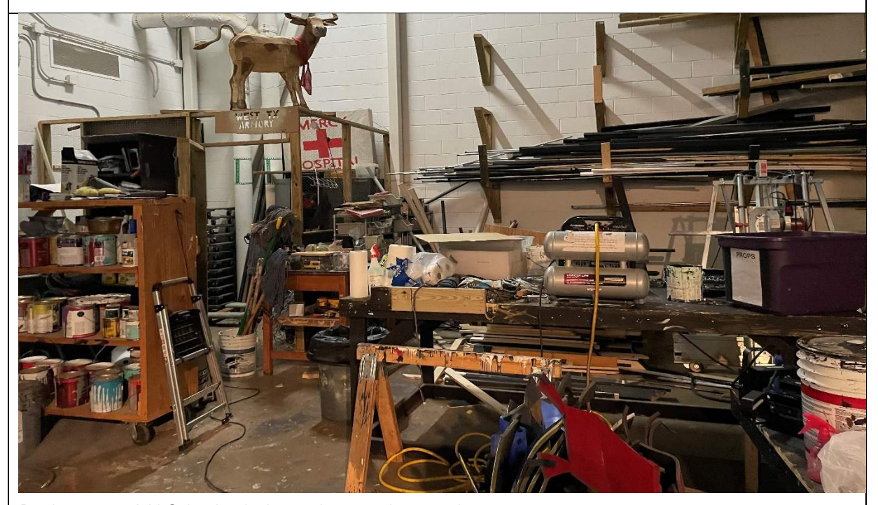
Backstage at MAC: Lacks dedicated scene shop and storage.