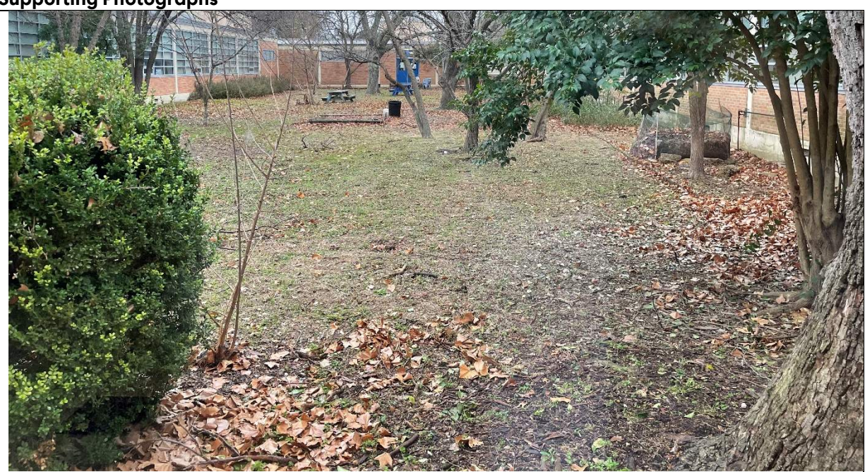
Outdoor Courtyard: Not directly accessible from studios and not accessible from outside building, so mower must be brought through school to maintain courtyard. No shade and inadequate seating for outdoor learning.