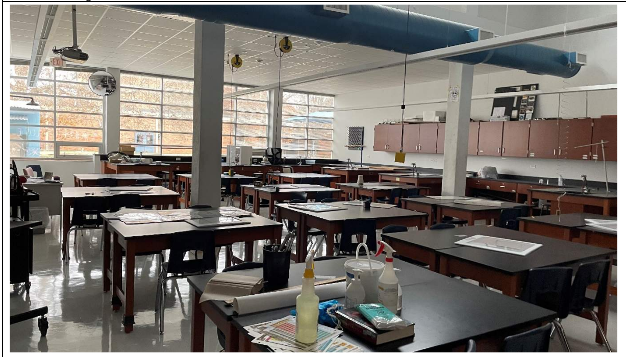
Science Lab Renovation: Adequate space, storage and prep area.