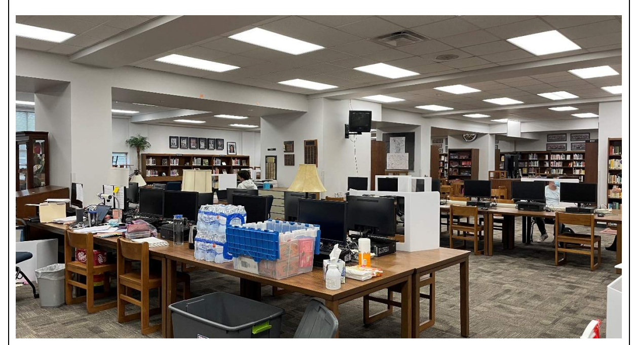
Media Center: Library in good condition, but most furniture is not reconfigurable or easily movable. No breakout rooms or individual study spaces.