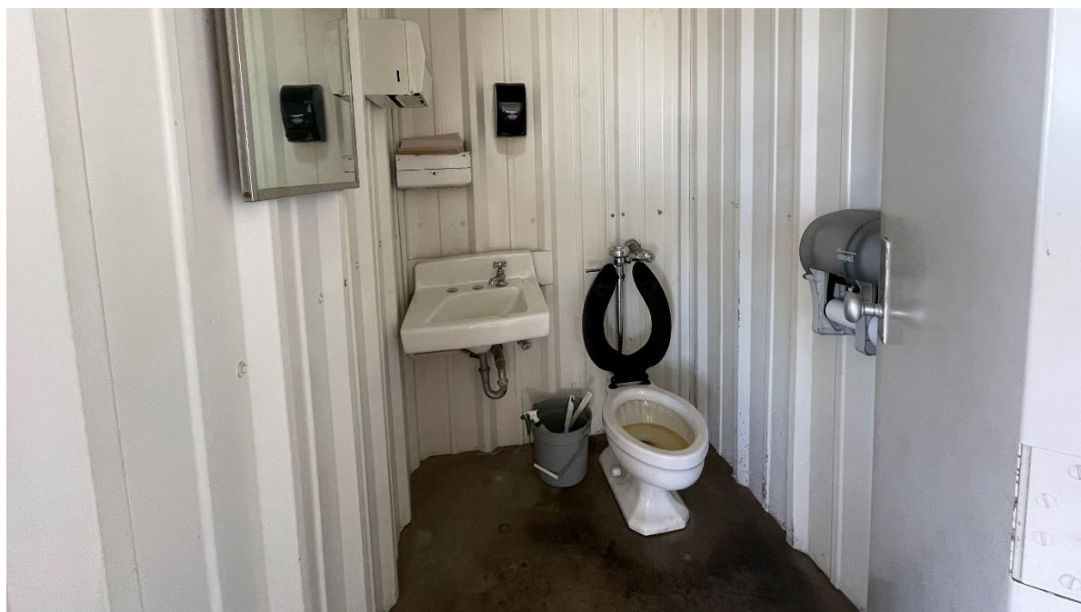
Restrooms for the press box are not accessible and in very poor condition.