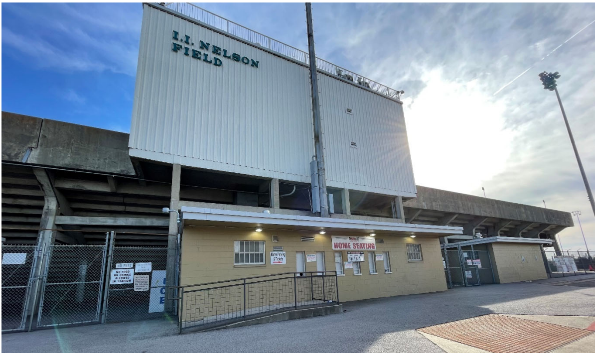
Interviewees desire a modernization for the exterior of the building.