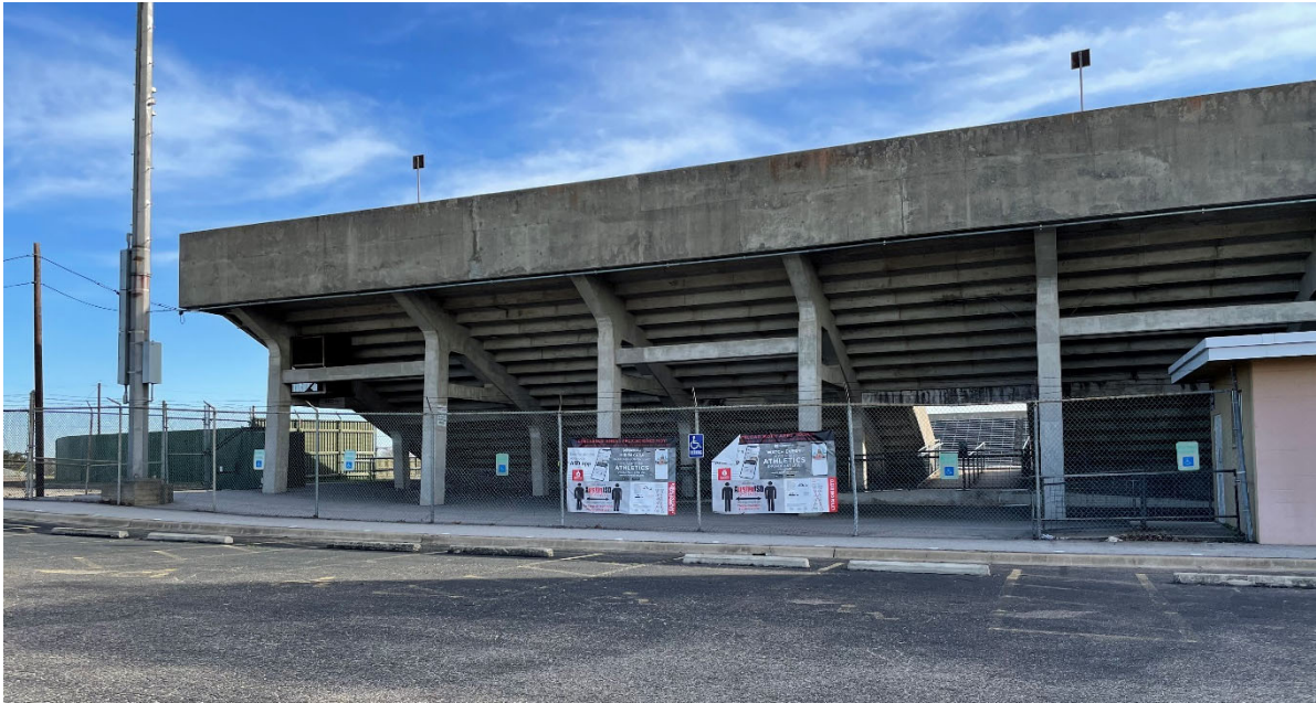
Concrete on the exterior of the stadium shows signs of aging.