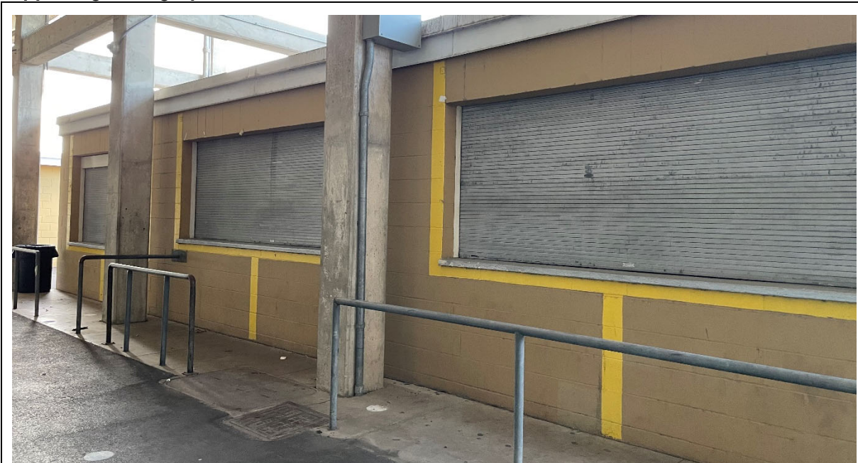
Exterior view of the concession stand. Needs to be updated and modernized.