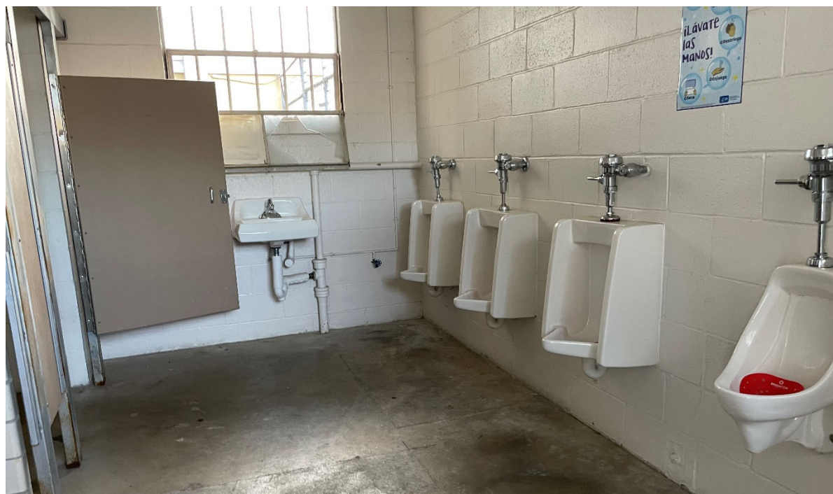
Restrooms are dated. Windows and doors do not function properly.