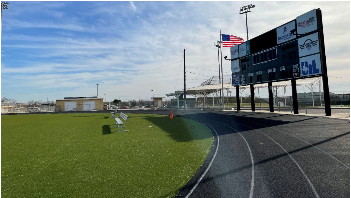
Field appears to be in good condition. Scoreboard needs to be modernized.