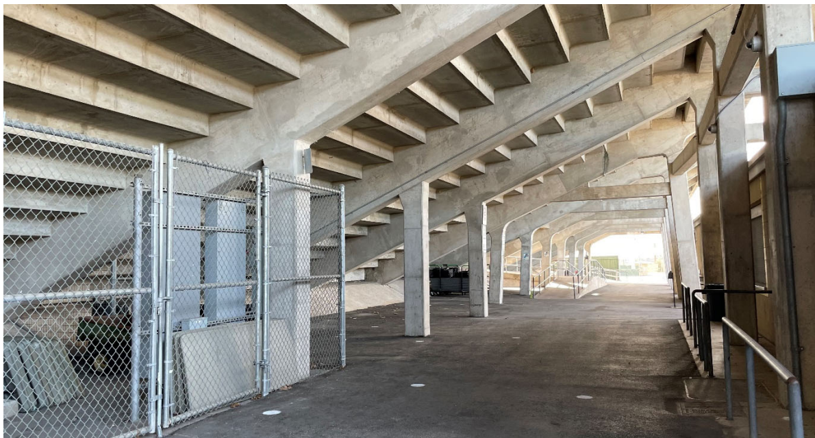
Reported pest issues underneath. More lighting is needed in this area.