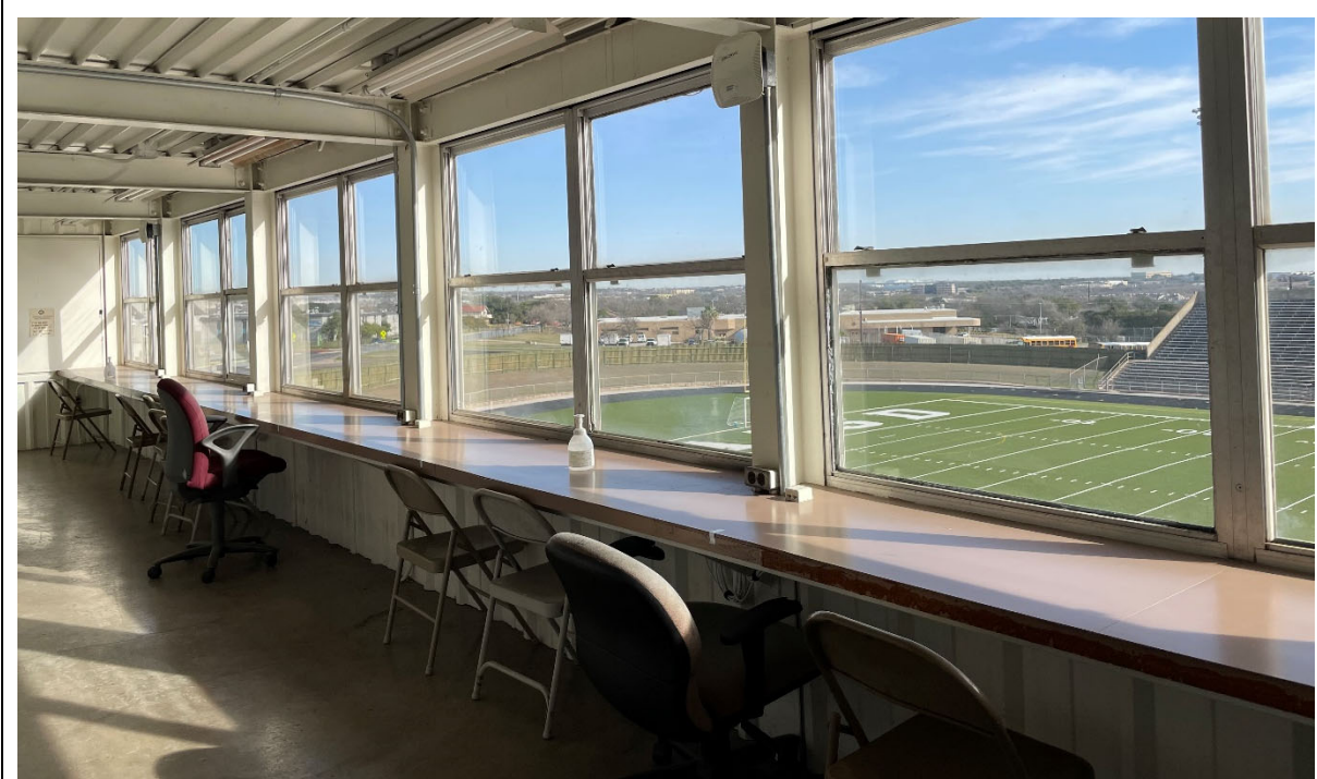
View of one of the press box spaces. Furniture is dated and there is no accessible entrance to the press box.