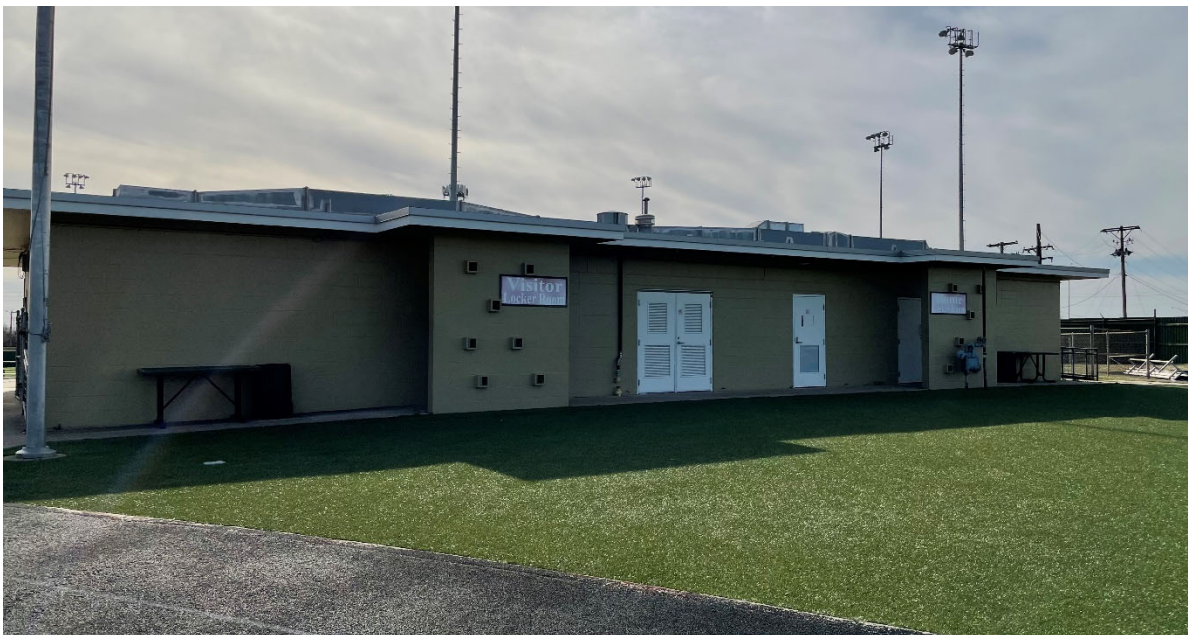
View of the existing field house building. The building appears in decent condition from the outside despite its age.