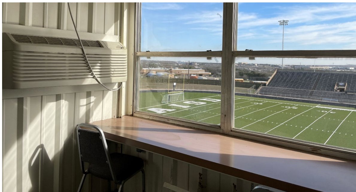
Split AC systems does not function well.