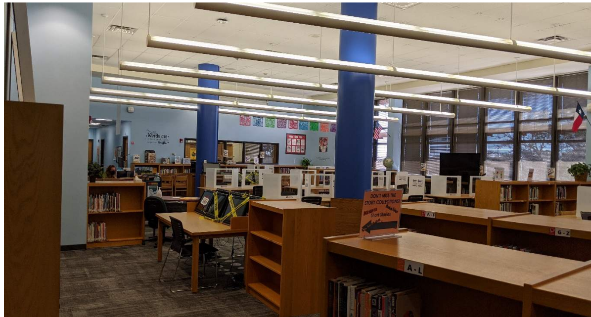
Media Resources: Library is open light filled space. Some furniture is heavy and not easily reconfigurable. Library was updated last year.