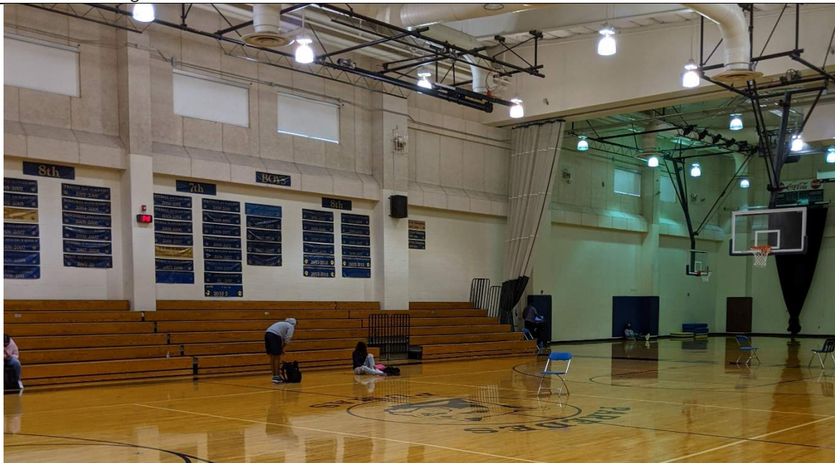
Athletics and Wellness: Gym is large and in good condition, but bleachers do not work well. Half are not usable.