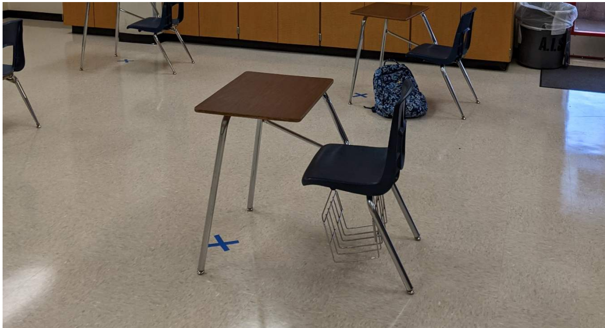
Studio furniture is unsatisfactory. Attached desks and chairs limit the ability to reconfigure for various teaching formats.