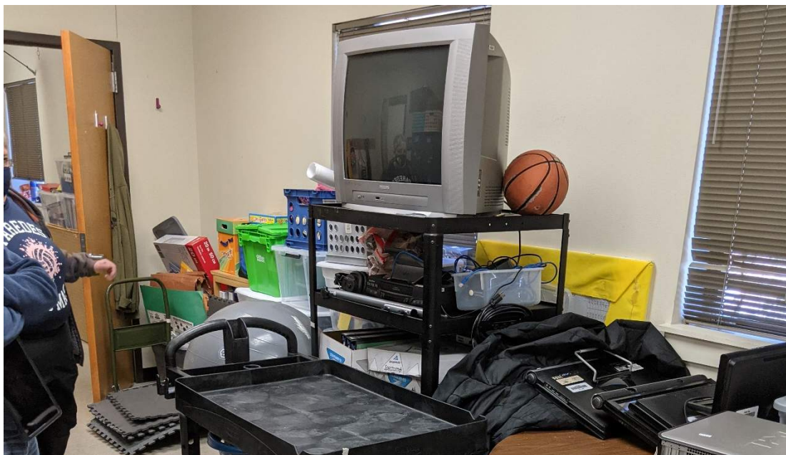
Special education lacks storage. Part of the life skills kitchen area serves as storage for various items. Area also needs a sensory room.