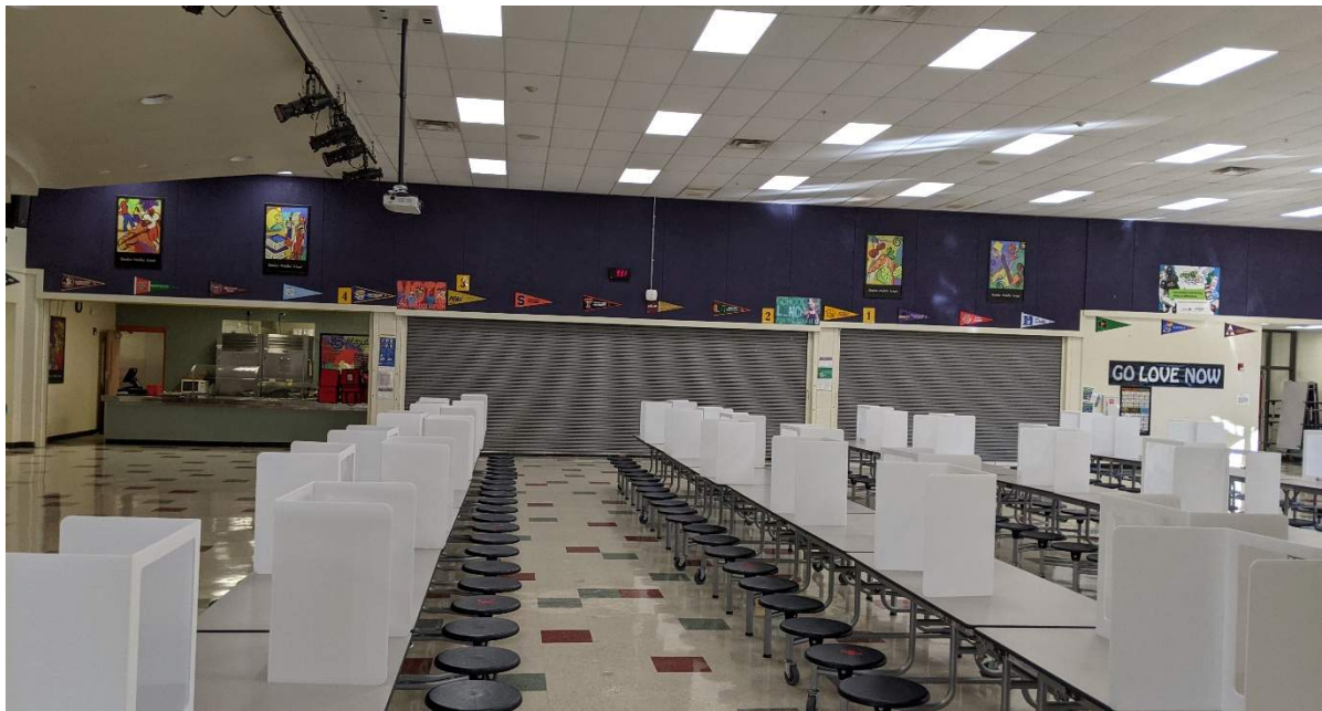
Food Services: Cafeteria is in good shape but only has one type of seating available. Stage is in good shape.