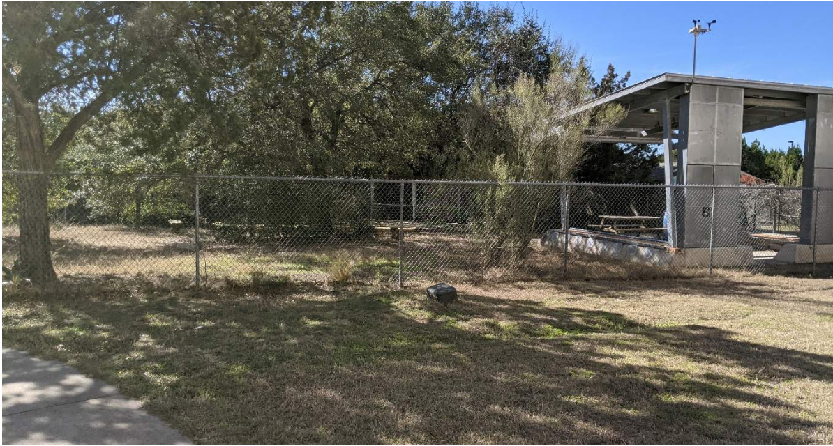
Outdoor studio is provided by Austin Energy pavilion (typical of many schools throughout the District) and is in average shape. School reports this space has been updated since the evaluation occurred.