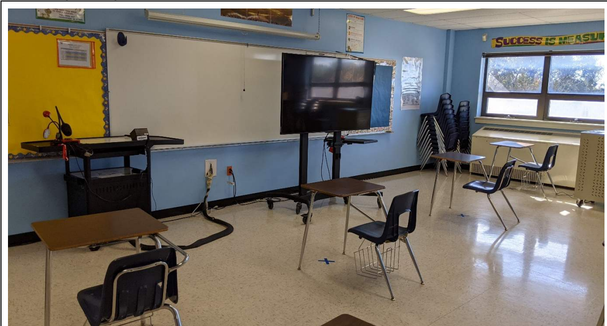
Academics and Learning: Typical studio has adequate daylight, dated furniture and some upgraded technology.