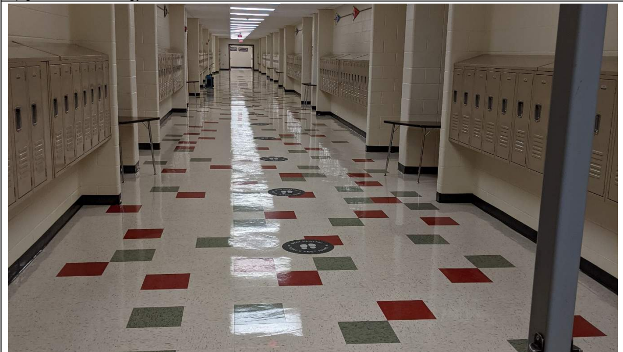
General Building: Corridors are good size and condition. Very little visibility between studios and corridors, limiting the possibility of independent study. School reports hallways lack ventilation.