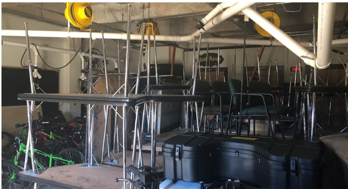
Wood shop studio being used as storage for furniture, bicycles and an AISD police all-terrain vehicle. Program space is underutilized as it has been used for storage prior to COVID.