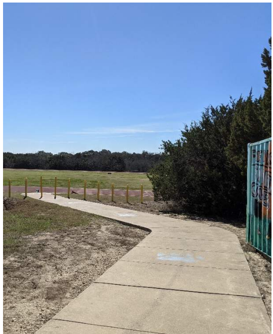
Sporting fields are generously sized but lack facilities for spectators. The school requests bleachers.