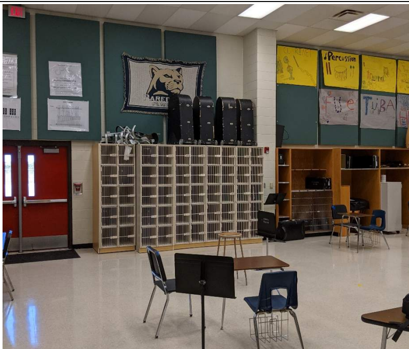
Visual and Performing Arts: Band/orchestra facilities are good size and condition. Bathroom in this area has the problematic sewage smell.