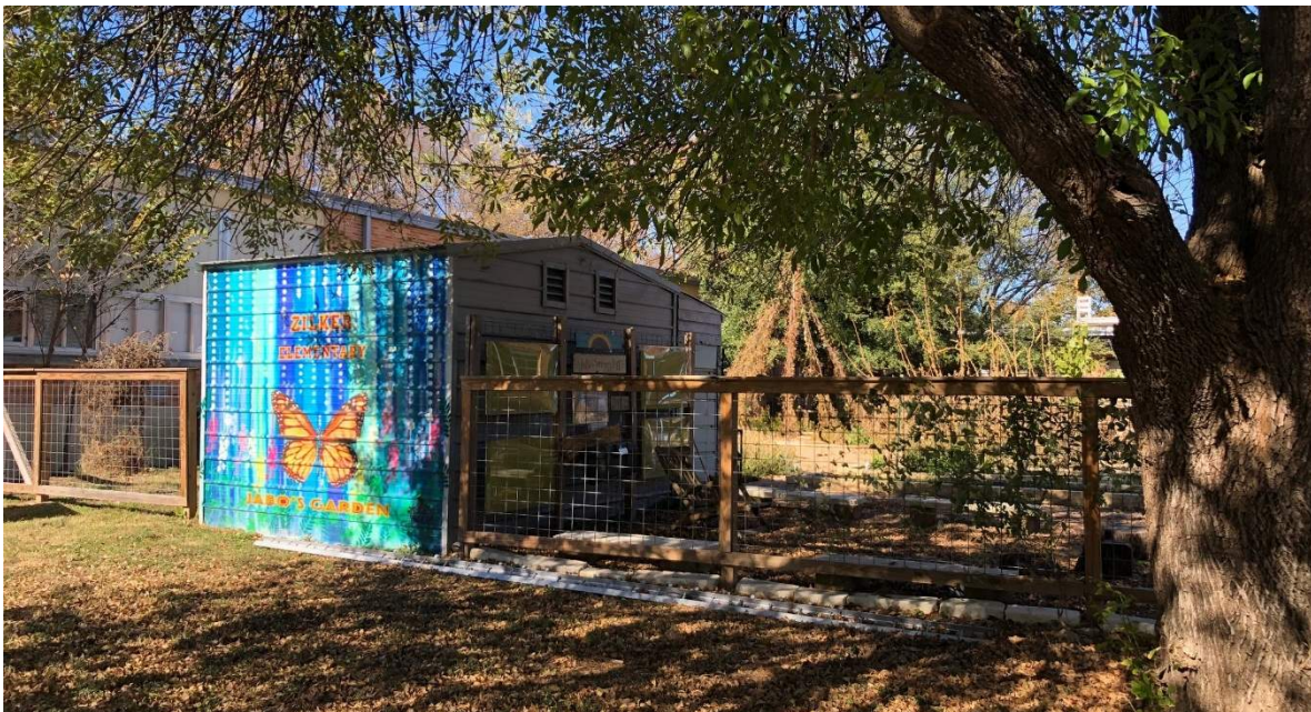
Outdoor Gardens: Well-tended and source of pride for the school.