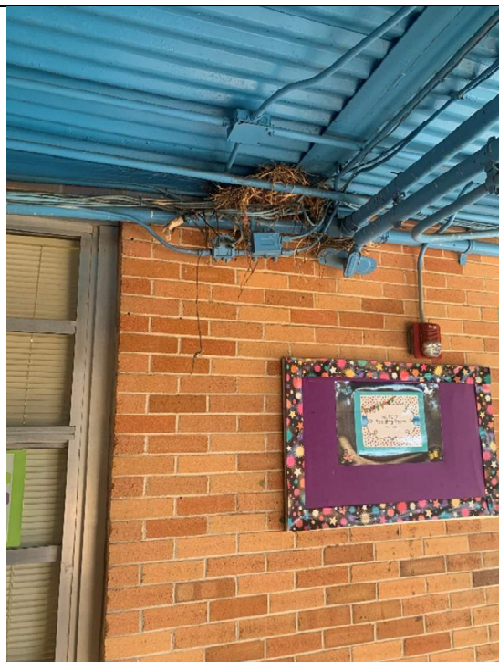
School noted many issues with pests/vermin.