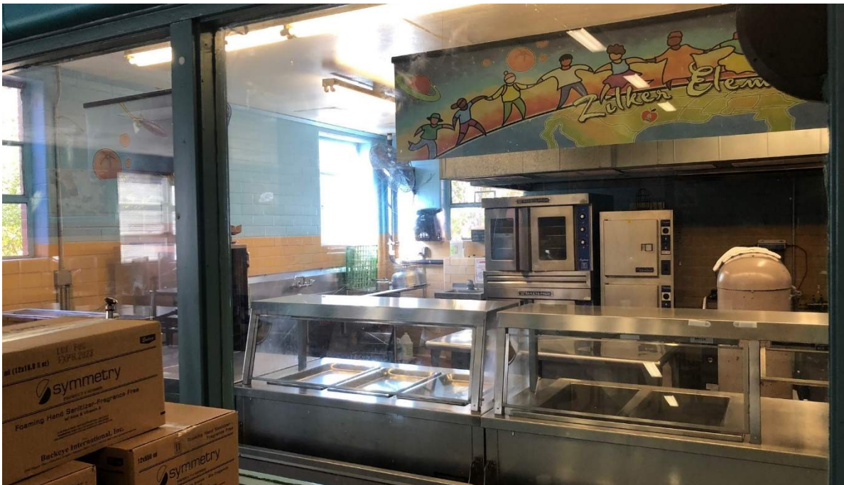
Kitchen/servery is undersized and does not meet current Ed Spec standards.