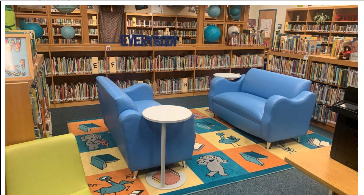
Media Center: Provides different seating areas.