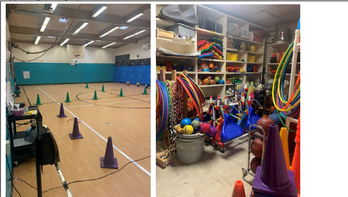
Gym and Support Spaces: Undersized or not present.