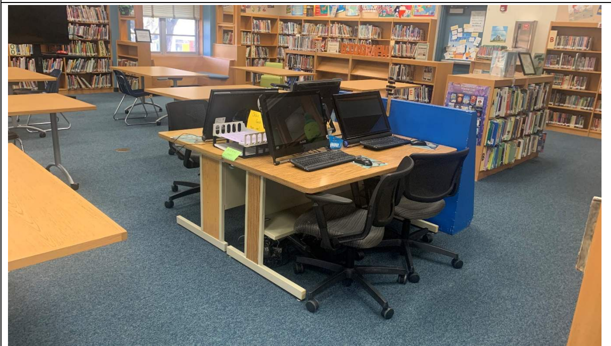
Media Center: Access to technology and multiple seating options.