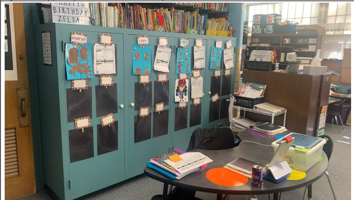
Storage is not consistent in all the studios. Entire school lacks storage spaces.