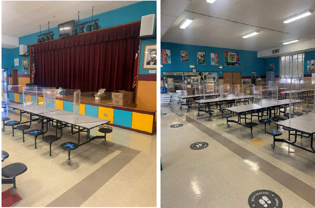
Stage and A/V in poor condition. Cafeteria SF accommodates 1/3 of learning population but is dated and doesn't function well in hosting events. School doesn't have storage available for adult-sized chairs.