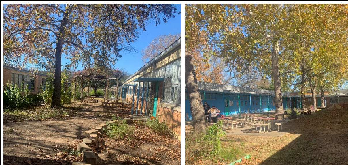
Breezeway circulation has some challenges. Requires student to go outside to use restroom. Outdoor space is utilized for spill-out/workspace. Ground improvements are needed to make it accessible and more fully utilized.