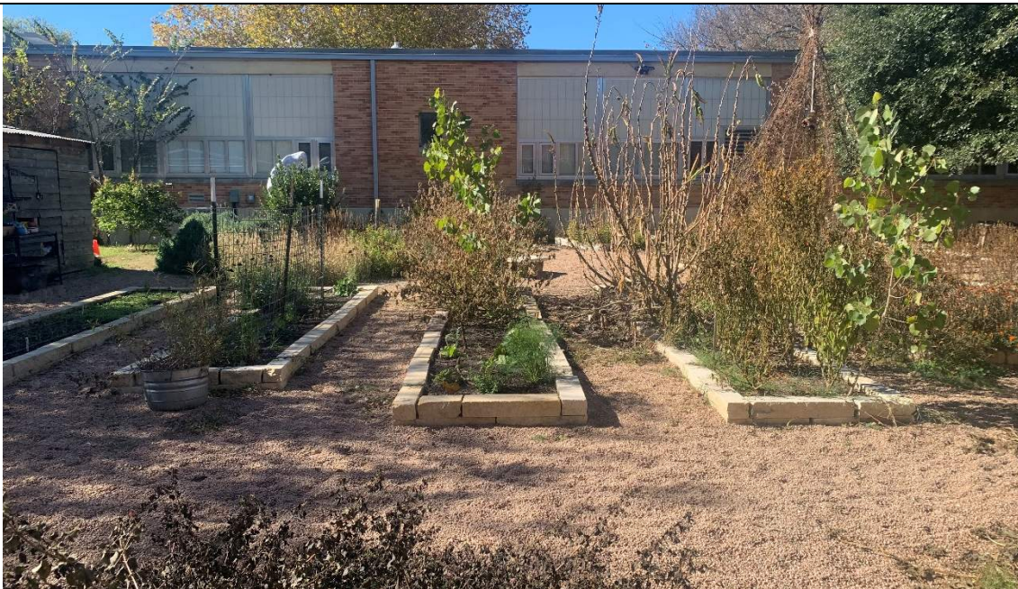
Outdoor Gardens and Husbandry: Chicken coop in the same area.