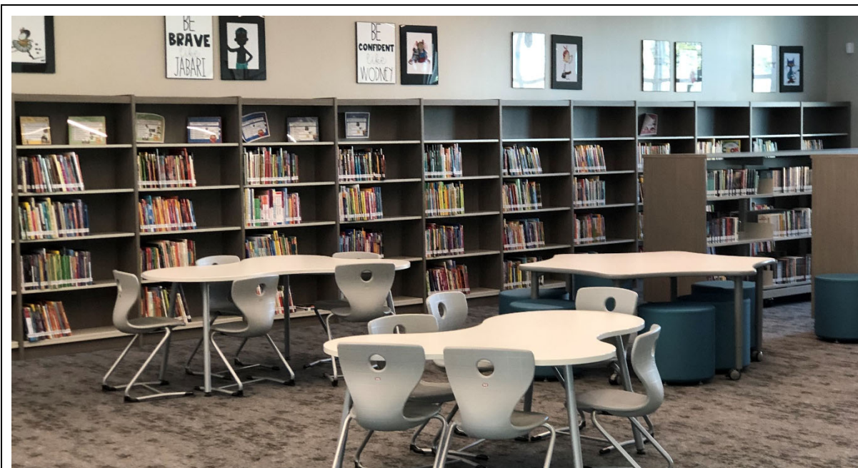
The Media Center just past the secured entrance lobby. Flexible furniture allows for different size groups.