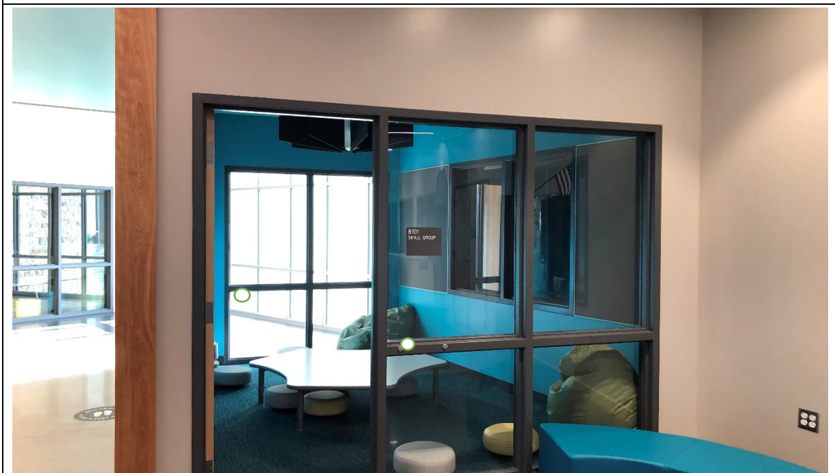
Small group rooms are located adjacent to studios and have good transparency for passive supervision.