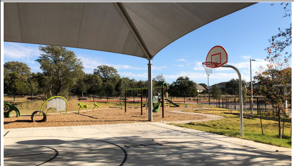
The outdoor covered basketball area is adjacent to the gym. Pre-K and kindergarten playground is beyond.