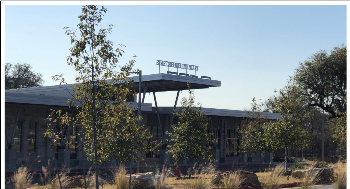
Entry to Bear Creek is welcoming, and a covered entry is provided. The school was inaugurated in 2020.