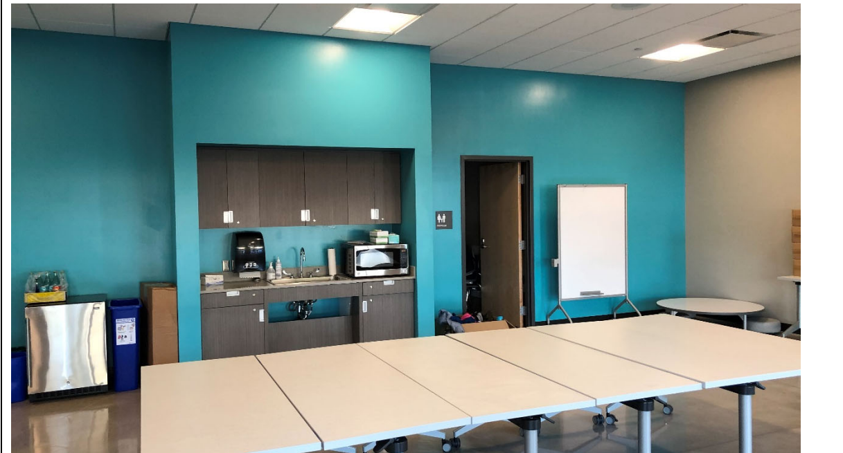
The community room, including a prep area and restroom, is adjacent to the secured entrance lobby for easy access to the public.