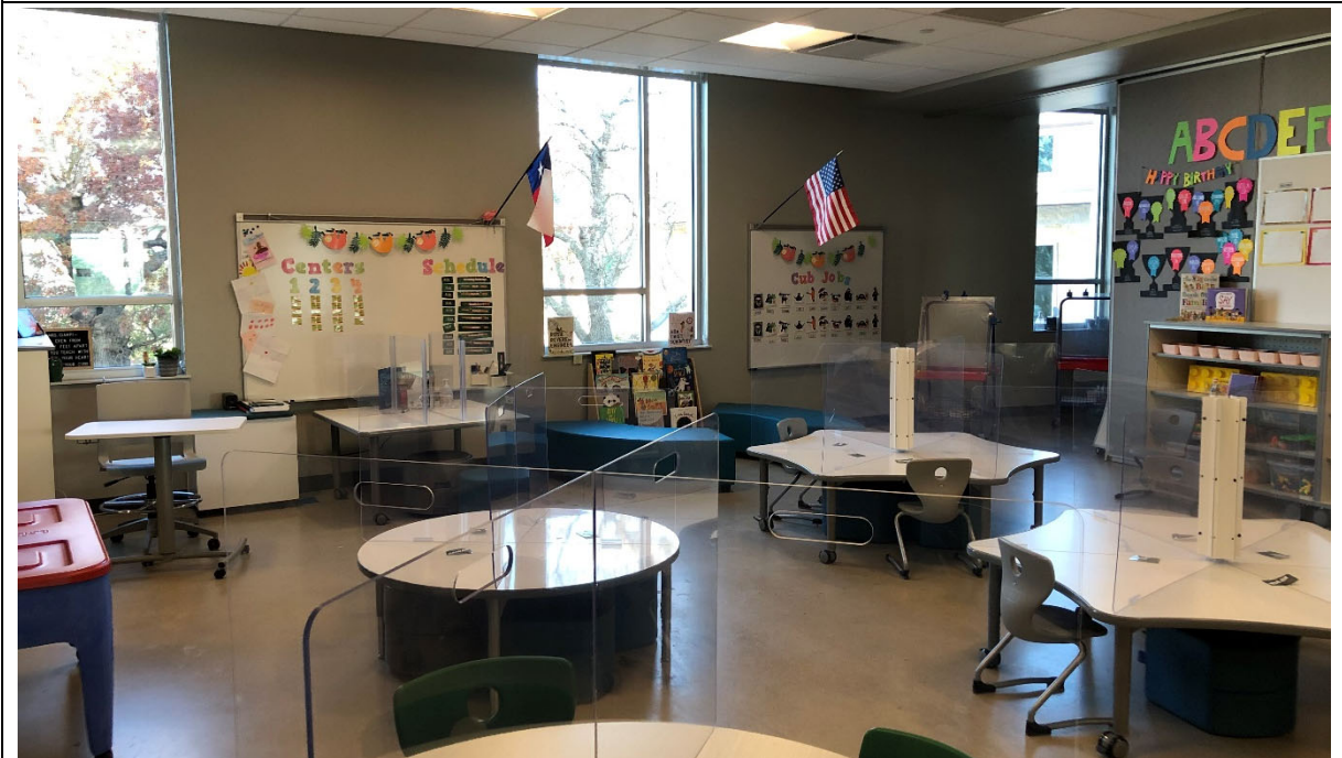
Studios have flexibility to create multiple areas for different teaching methods and have good control over artificial and natural lighting.