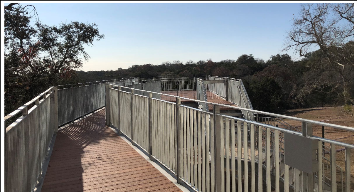
An outlook point connected to the studio wing allows a view of the Hill Country.