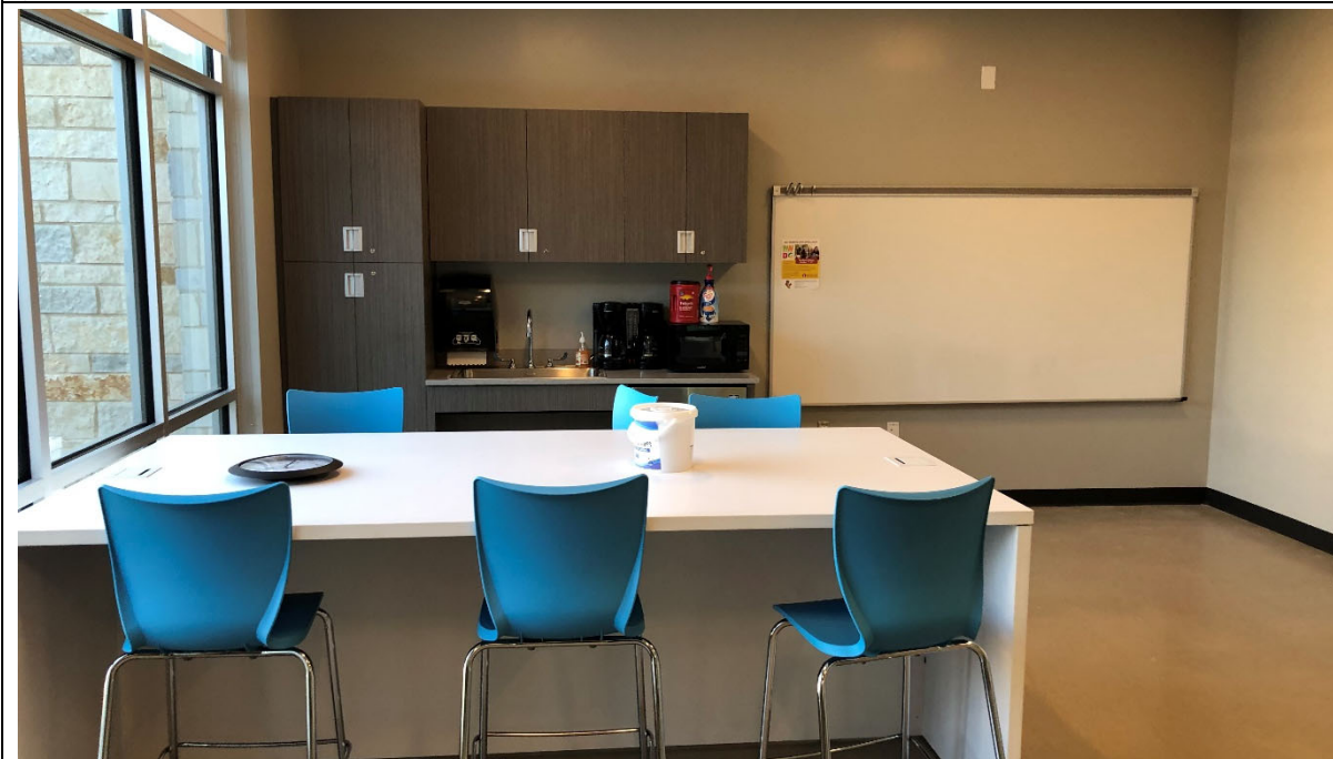
PLC room for staff is spacious and allows for group or individual planning.