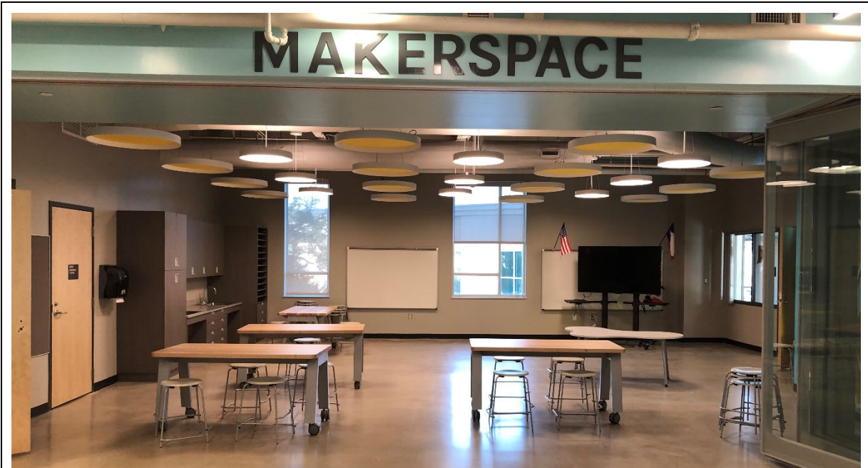
The maker space has movable partitions allowing the space to open to the corridor.