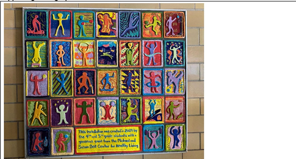
Mural in corridor displays school, community and student pride.