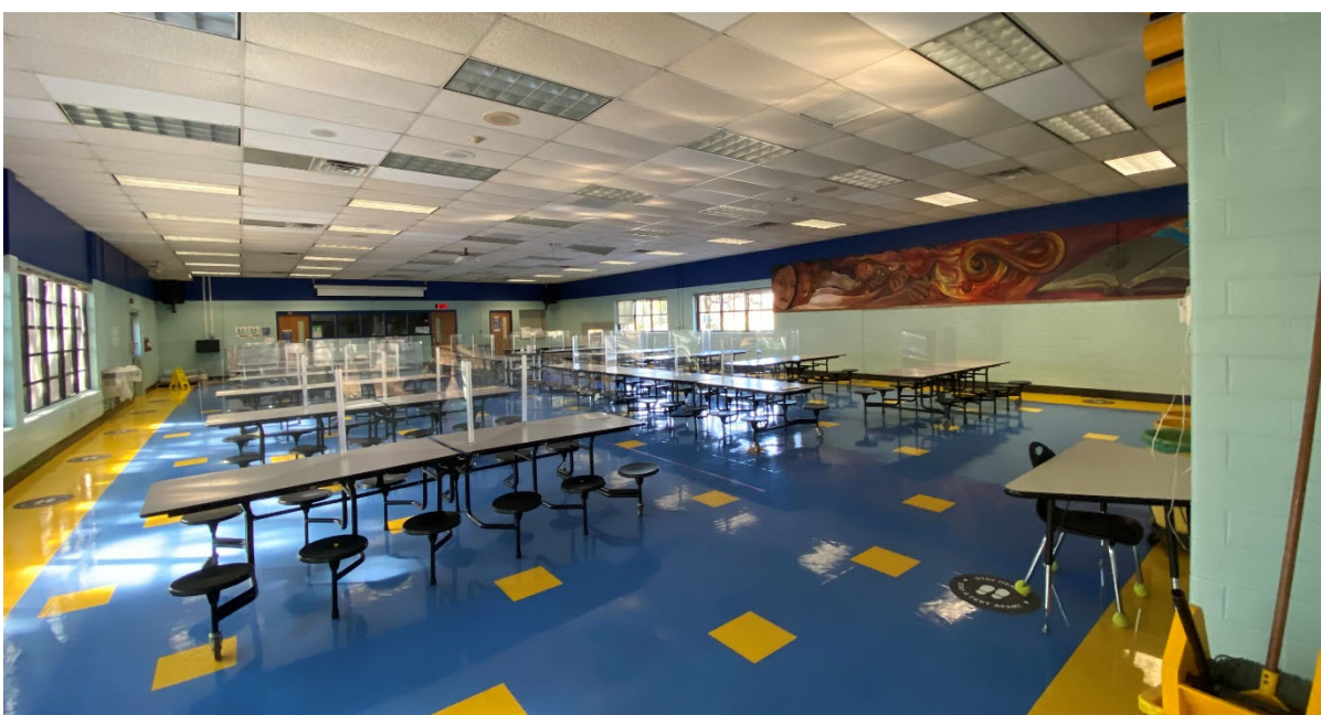
Dining commons is spacious and filled with natural daylight but does not have a connected stage.