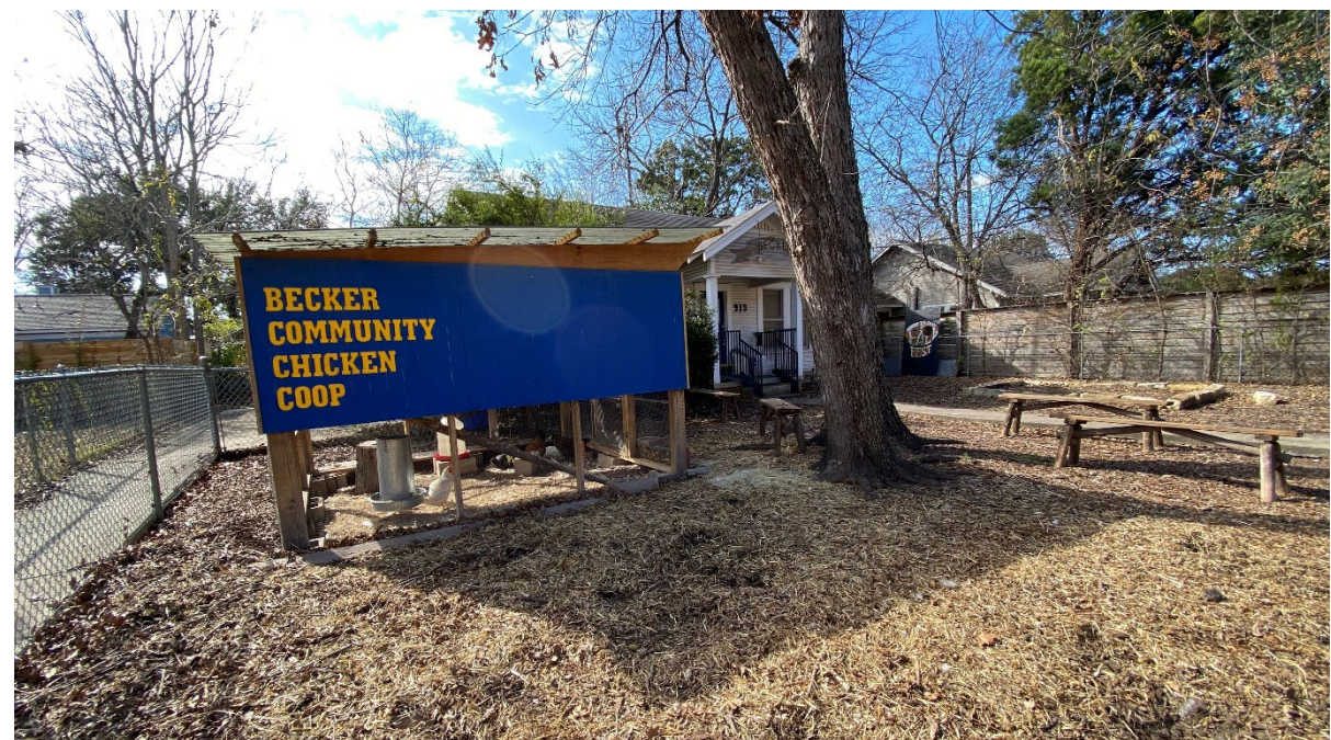
School chicken coop provides animal husbandry learning opportunities, though it's disconnected from the main building.