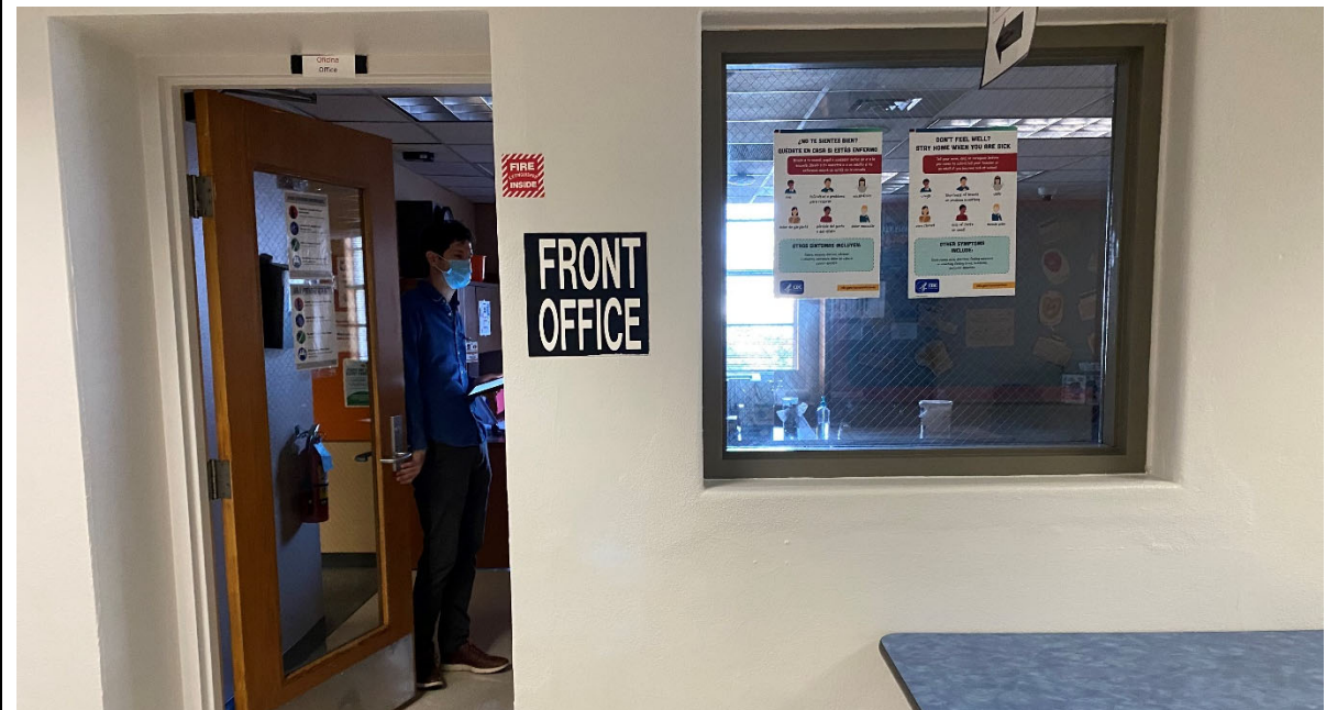
The reception area is small and does not feel inviting. Reception is disconnected from the main entrance and lacks transparency and a view to the front door.