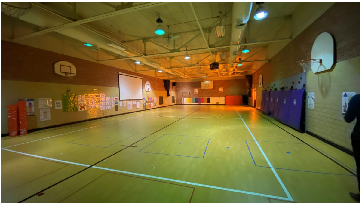
Although it lacks daylighting and views, the gym is an adequate size and has new flooring.