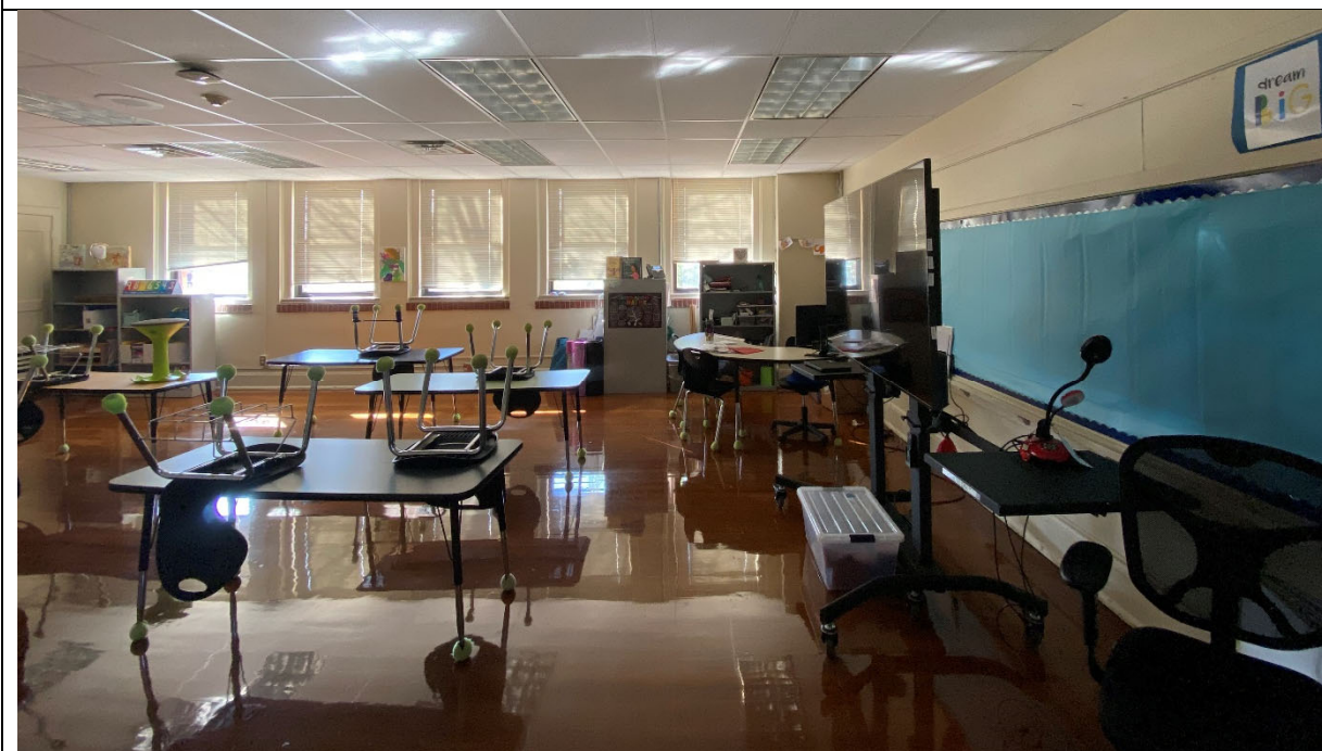
Studios are small and lack flexibility. They are rich in natural daylighting and views, but do not provide proper technology or reconfigurable furniture.