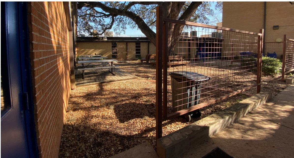
Outdoor seating area directly connected to the dining commons.