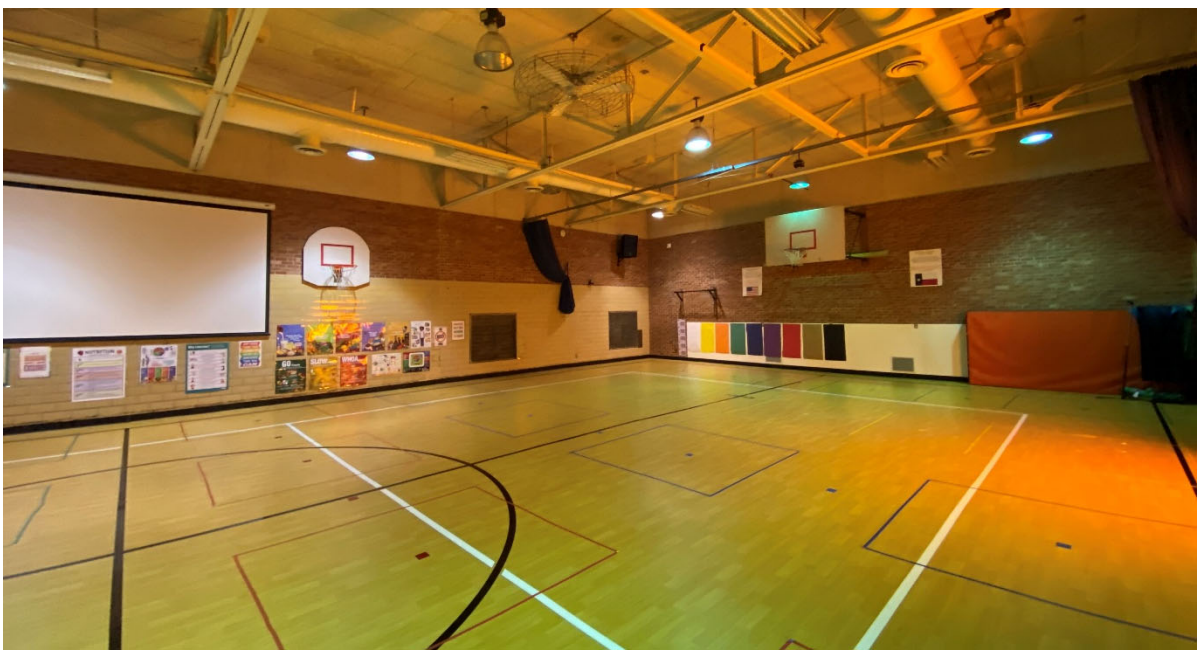
Part of the gym has been converted to a makeshift stage, though it's disconnected from learning spaces.