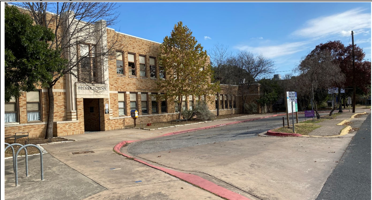
Student drop-off provides small queuing space and lacks overhang. Main entrance is not easily distinguishable from the street. (Main entrance is near the right side of this photo.)