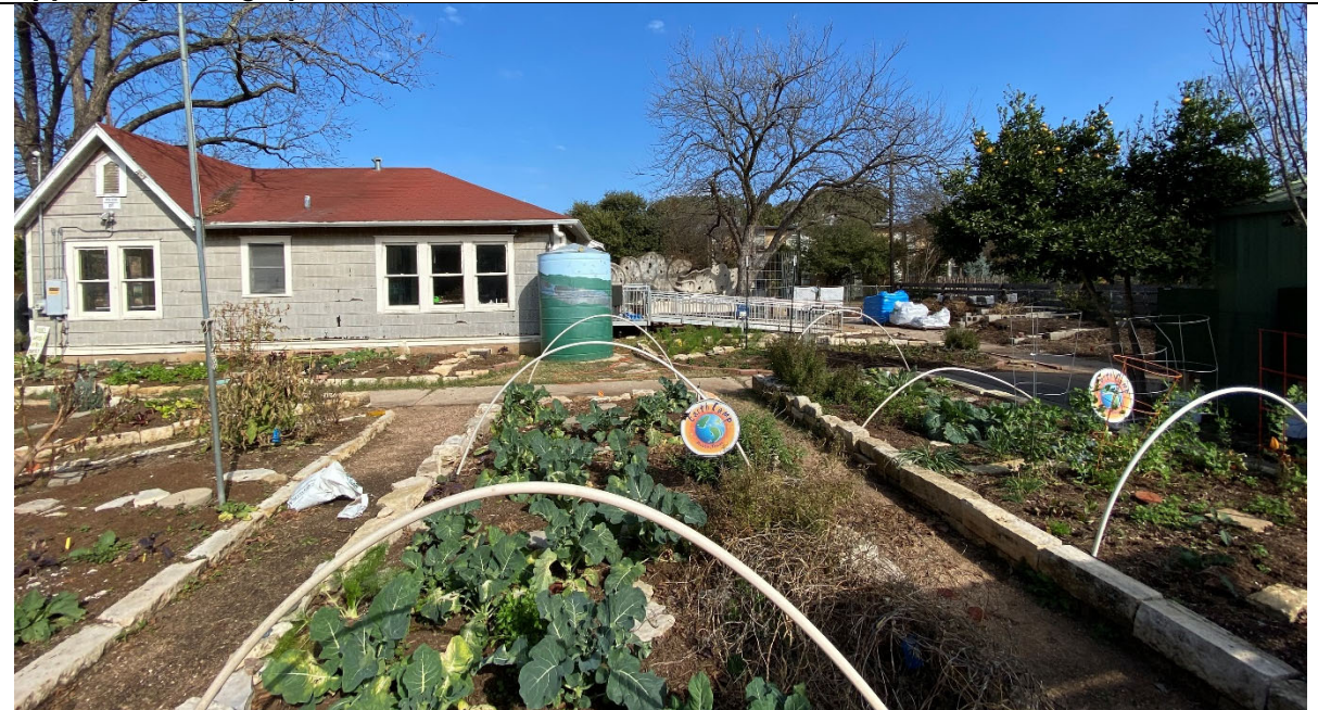
Outdoor learning gardens provide plots for each class to grow their own crops, though they're disconnected from the main building.