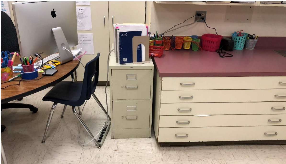
Electrical connections are lacking in studios for charging devices. Extension cords and power strips are used in studios and there are no centralized charging locations.