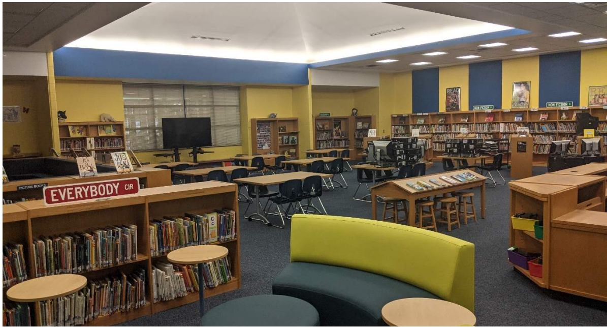
Library has a mix of furniture for social interaction. Tables have wheels for ease of reconfiguration and chairs are stackable for storing.