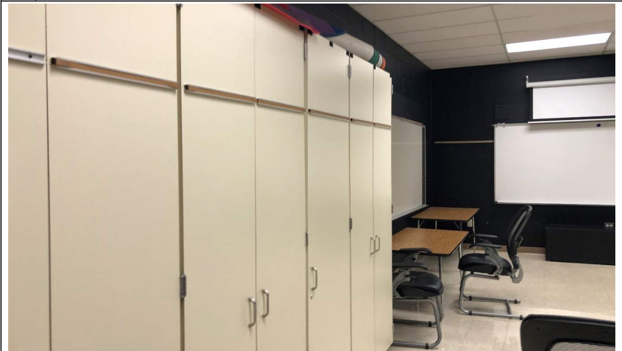
Black box theater room includes built-in cabinet storage.