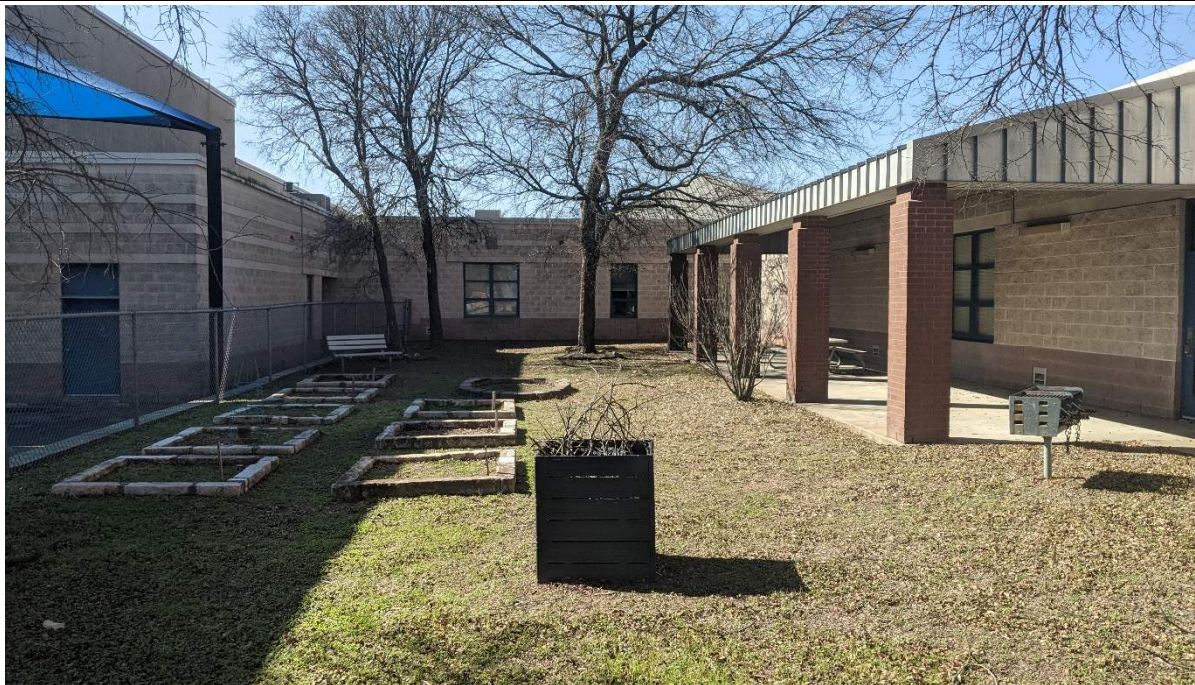
Studio wing with direct connection to small, fenced-in exterior space. There is a picnic table and a bench. Area needs further development to function well as an outdoor learning space. It was noted by the District Project Manager that the cover (left side of image) for the play area is torn and needs to be replaced.