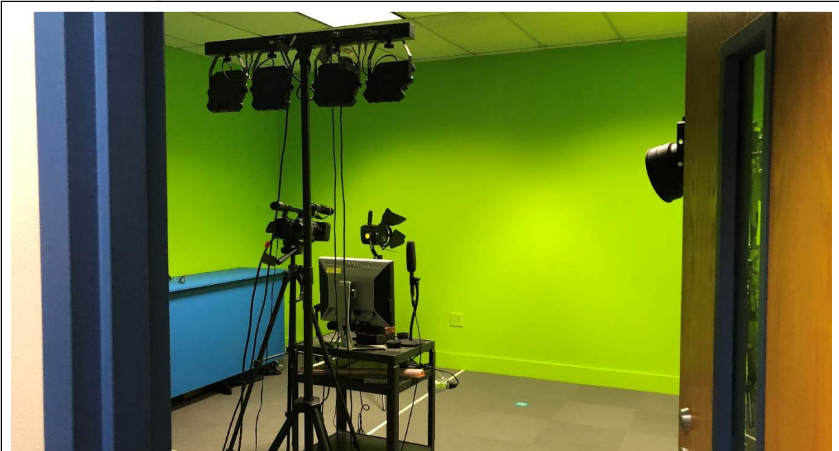
Dedicated green room for video media production.