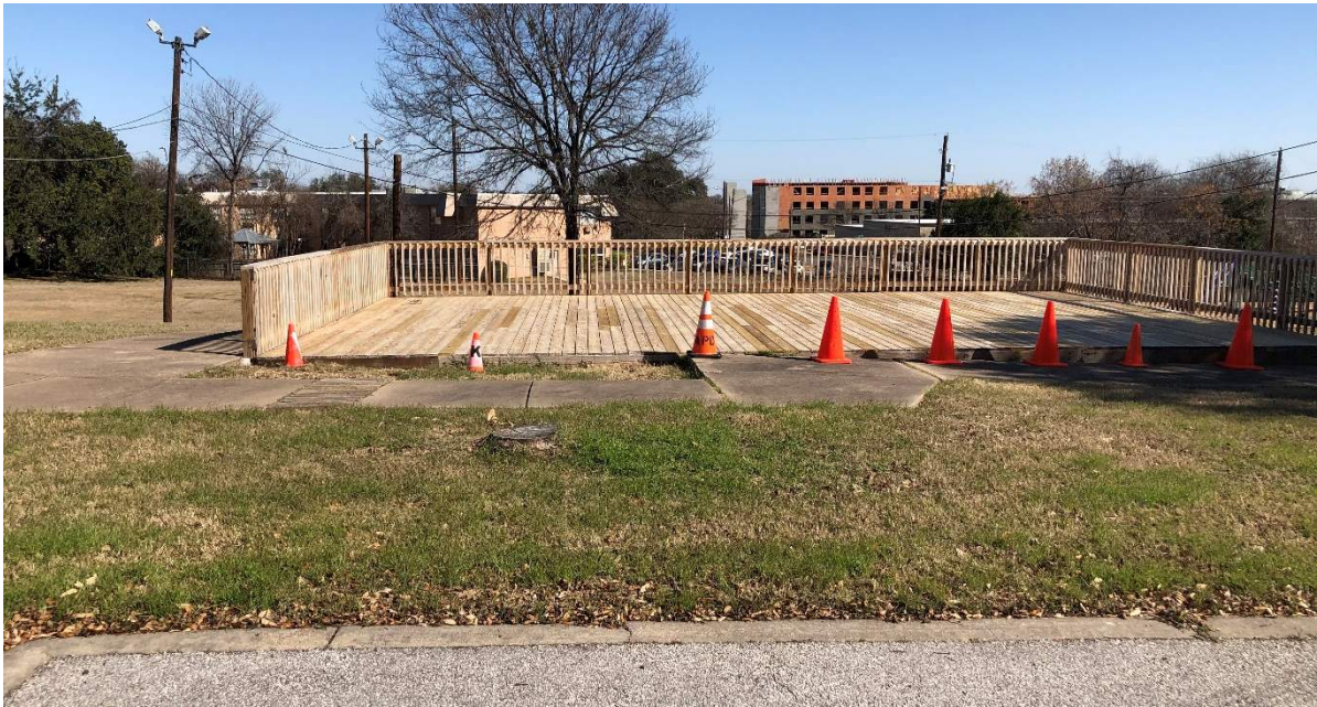
Wooden deck was built as an Eagle Scout project. It needs further development with shade and furniture to function as an outdoor studio space.