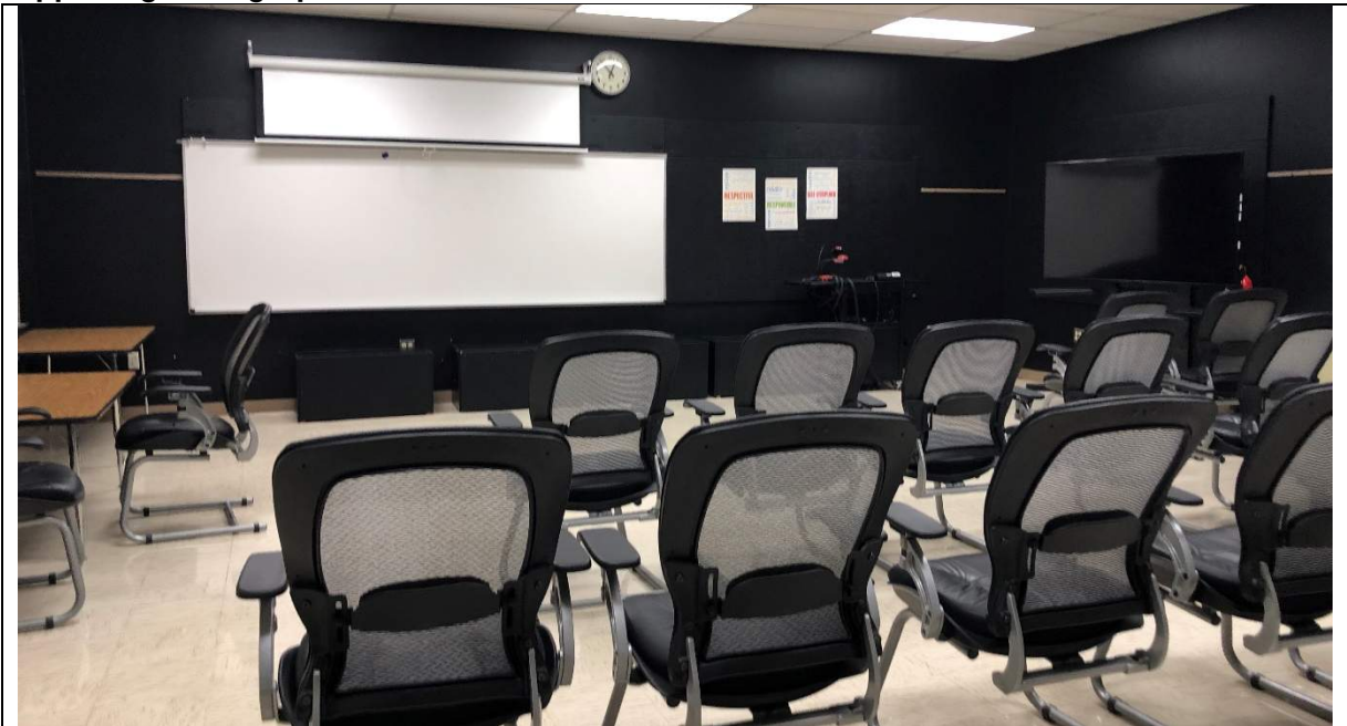
Converted studio serves as a black box theater. Space has connected storage closet and ADA-compliant restroom.