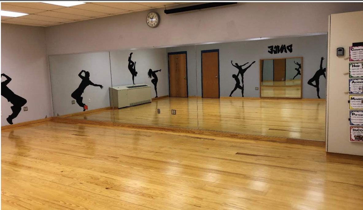
Opposite wall of dance room includes built-in storage cabinet.