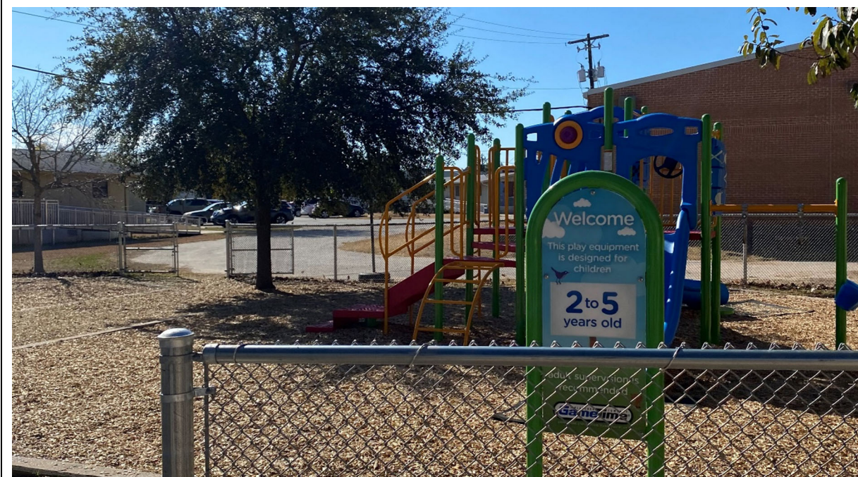
Playscape equipment is not shaded except with tree canopy