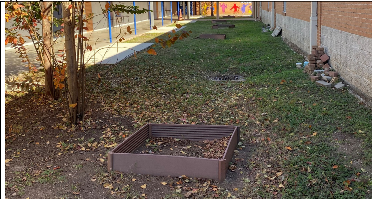
Outdoor gardens are in poor condition and do not appear to be in use.