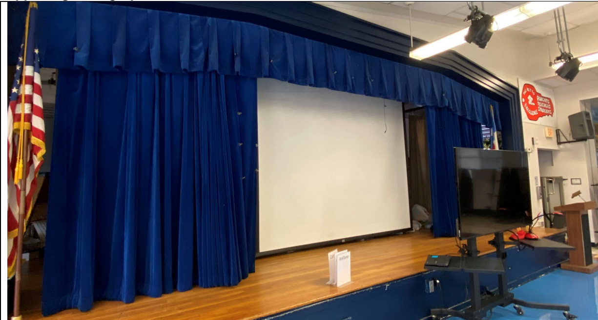
Stage is small with outdated lighting and production equipment. Stage storage is limited.