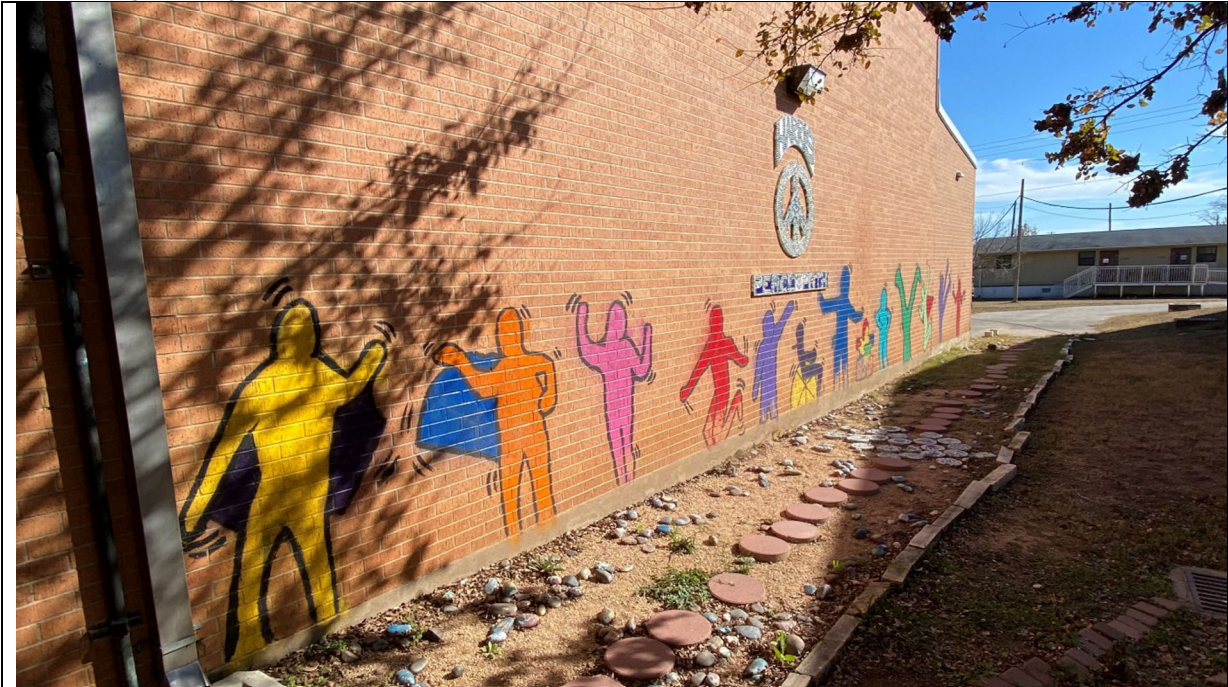
School pride is on display throughout interior and in some exterior locations.