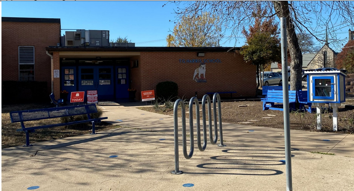
Harris ES Main Entrance: A canopy covering is provided at front entry and signage is hard to read from the street.