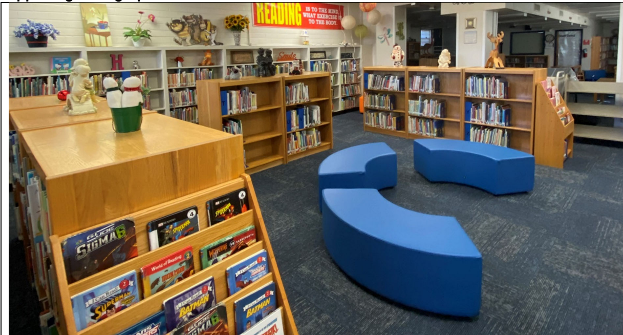
Library is small but does have some flexible furniture settings.