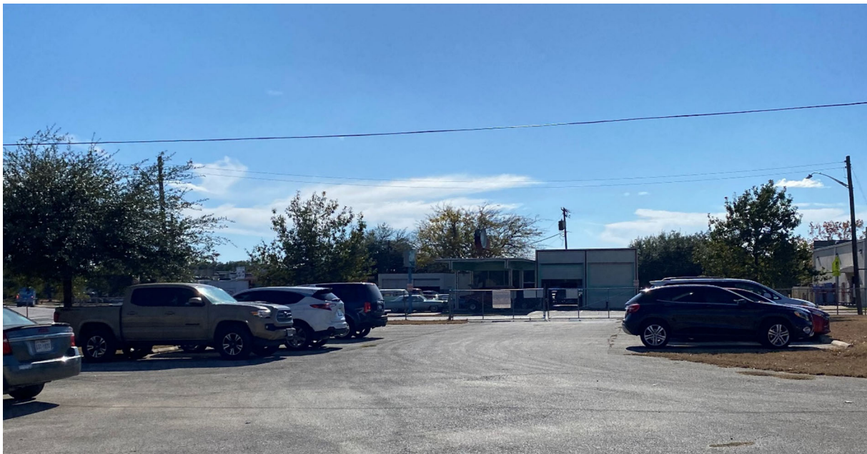
The bus drop-off and rear parking must access through gate. Buses do not have a circular drive for drop-off.