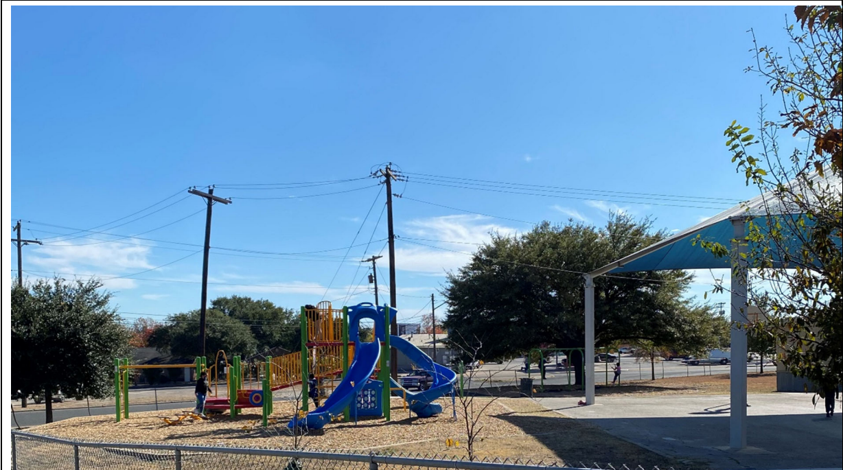
Basketball court has adequate shade covering, but playground does not.