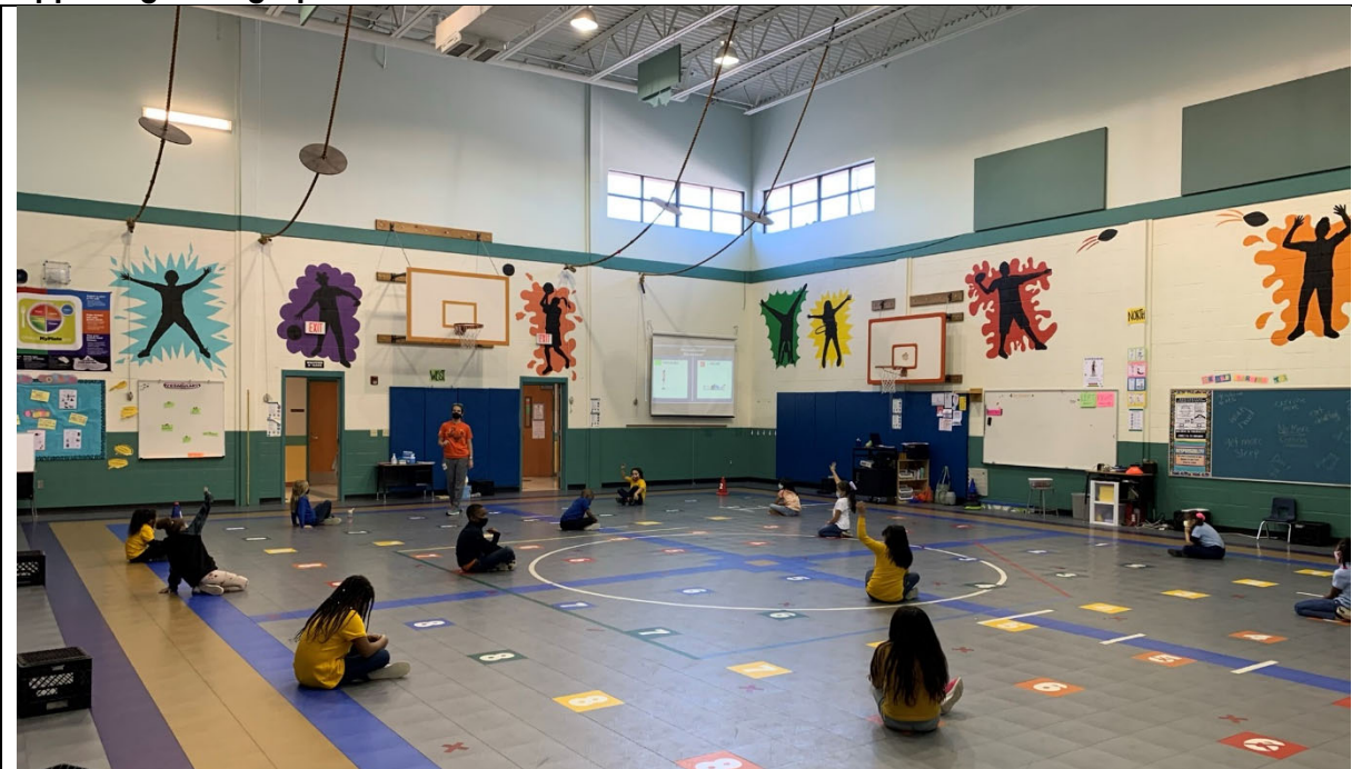
The gym is connected to the cafeteria via an operable wall. It needs some updates to function well.