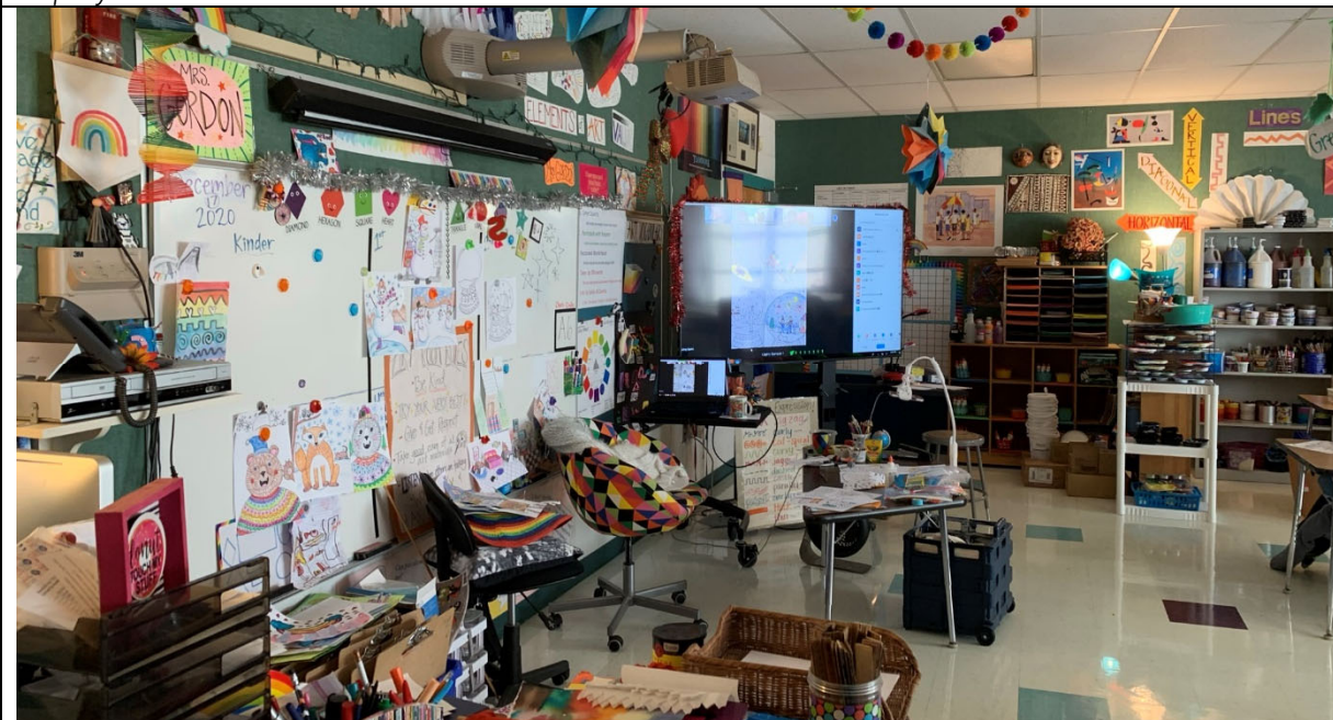
The art studio is appropriately sized per the district's Education Specifications and has the appropriate support spaces, including storage and a kiln.