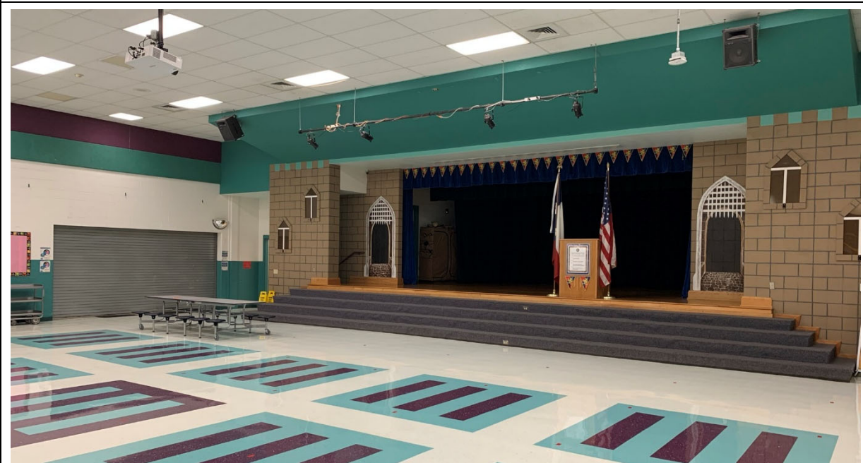
The cafeteria is an adequate size and in good condition. There is no connection to outdoor dining space, nor access to natural light. Two serving lines are present in the kitchen and the space has dedicated restrooms that are shared with the gym.