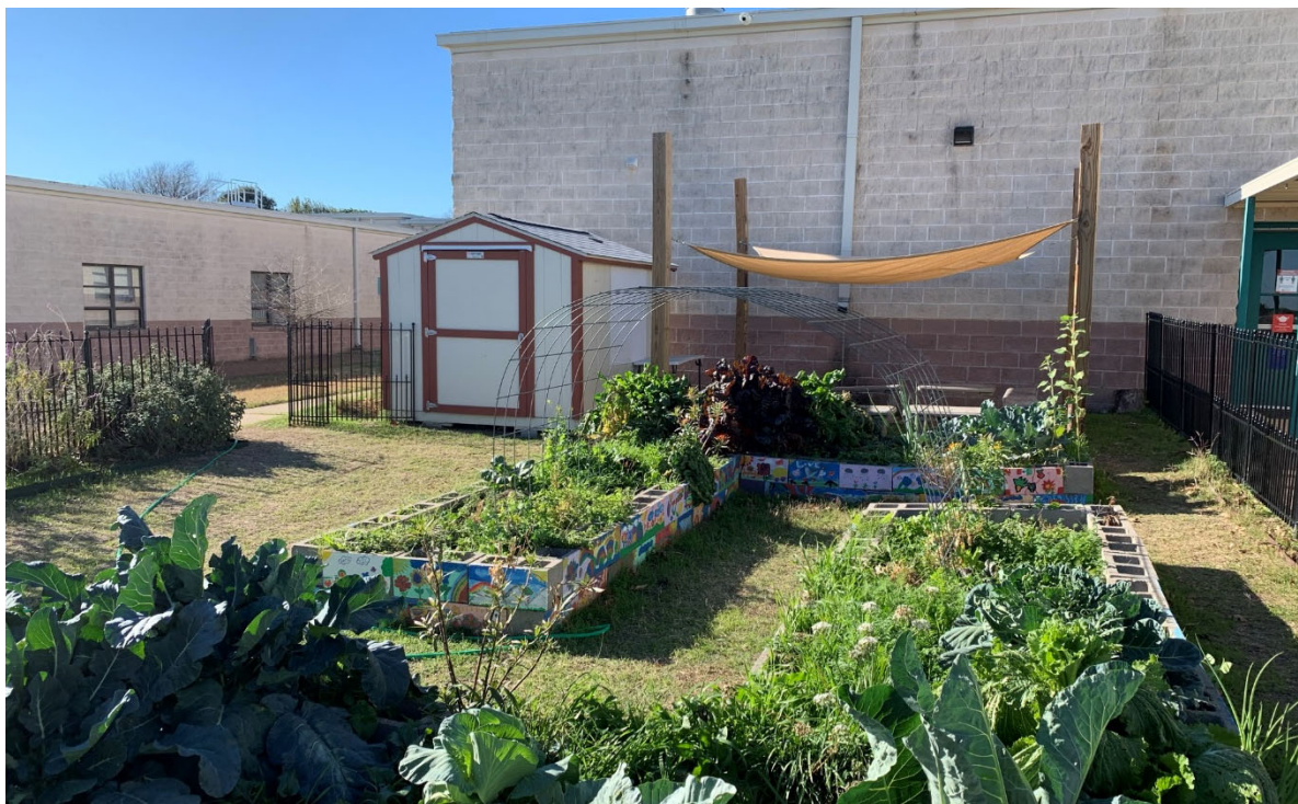
The campus has a thriving garden with access to water and a small outdoor classroom with a whiteboard under a canopy structure for shade.