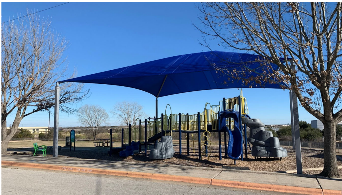
There are two covered playgrounds on campus for different grade levels. They have good connection to the gym and other outdoor activity spaces.