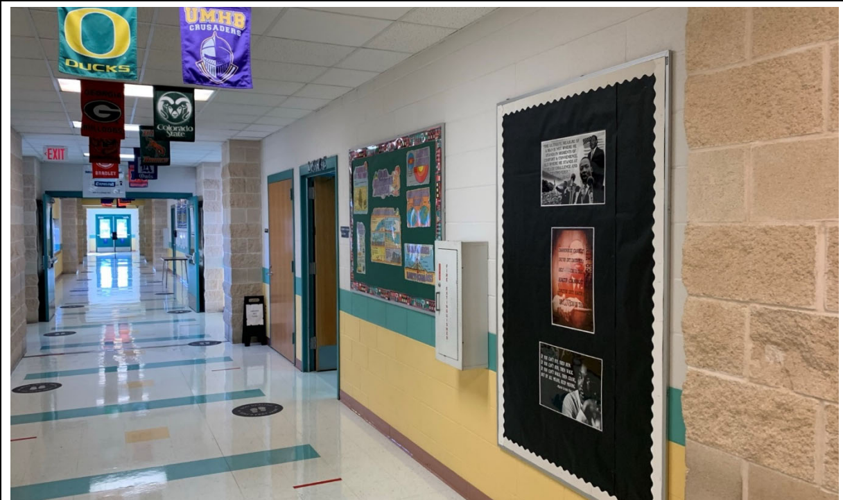
Corridors throughout the building are adequate in width and have opportunity for 3D or 2D display of student work.