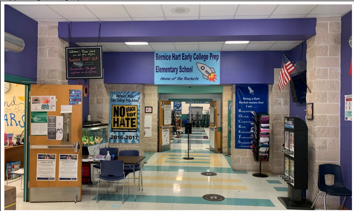
Cafeteria is easily accessed from main entry for after hours events.