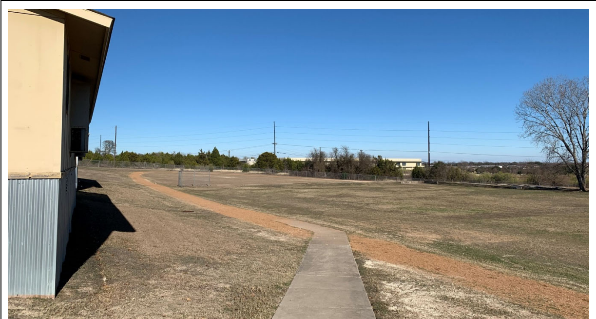
A large track is located at the back of the campus; it needs updates to function well.