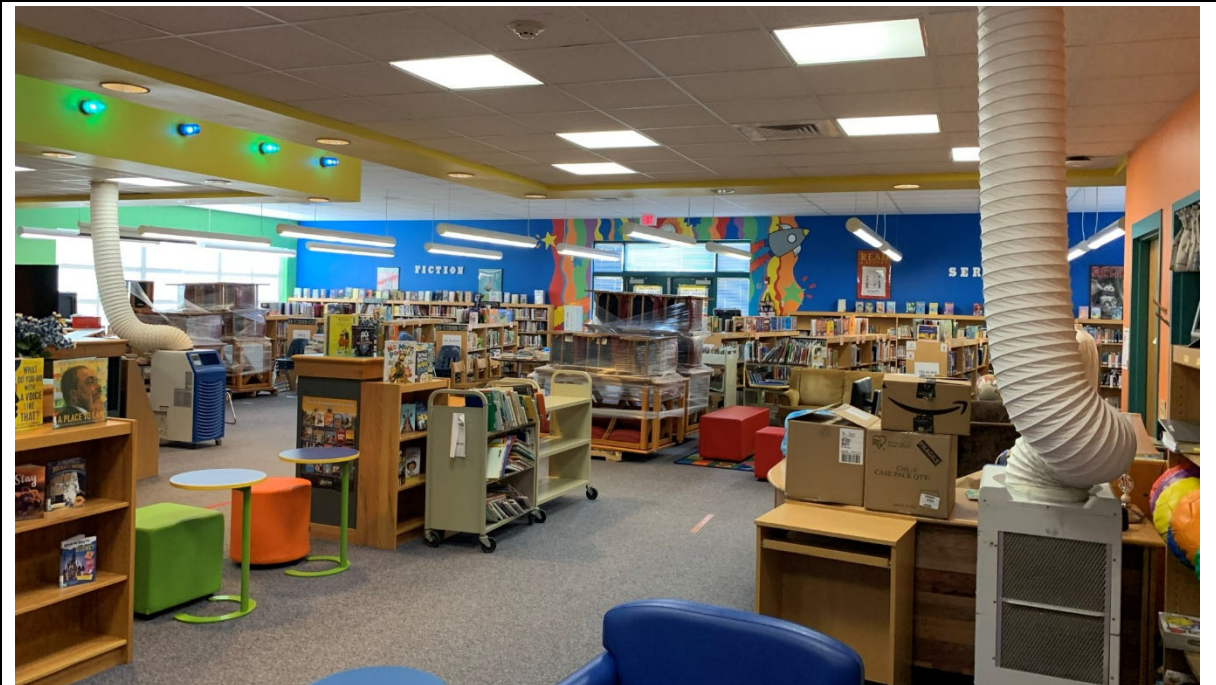
The media center is undersized and lacks the space to hold large groups or collaborative work. The inflexible furniture limits rapid reconfiguration of the space. At the time of the site walk spot coolers were present due to HVAC issues in the space.