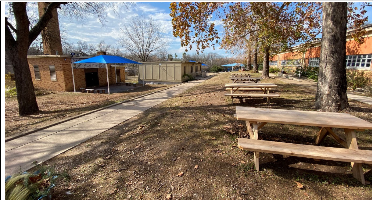
They have converted the old boiler building into the backdrop of the outdoor stage. Outdoor tables and the topography create a lot of seating space.