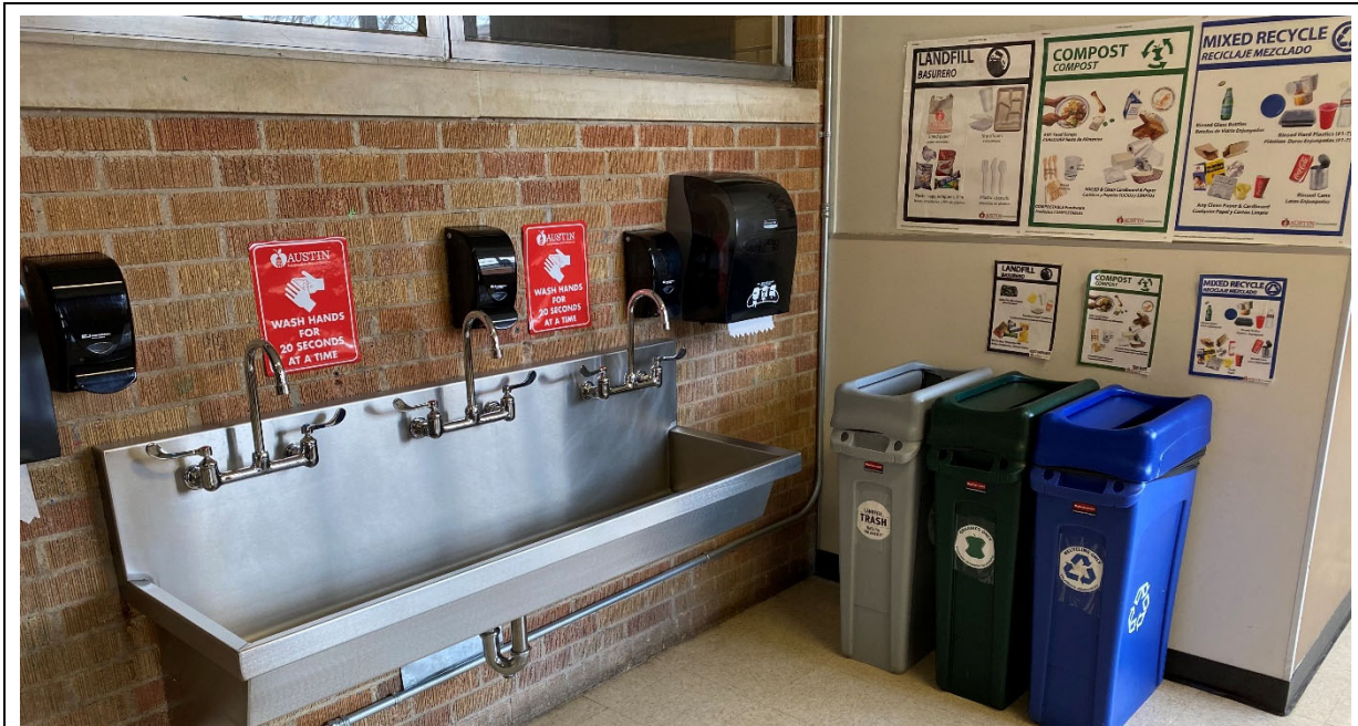
Waste collection is clearly presented and labeled in various areas similar to the one shown.