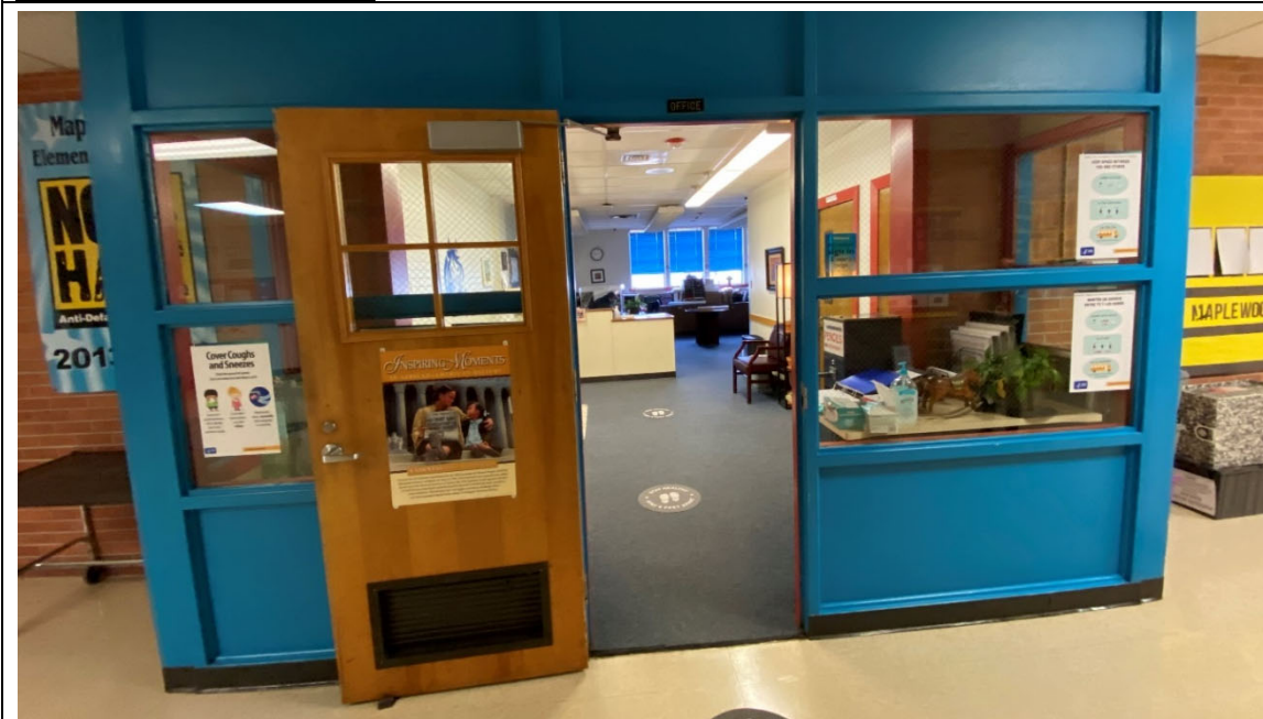
Administration Spaces feel welcoming and are adequately sized.