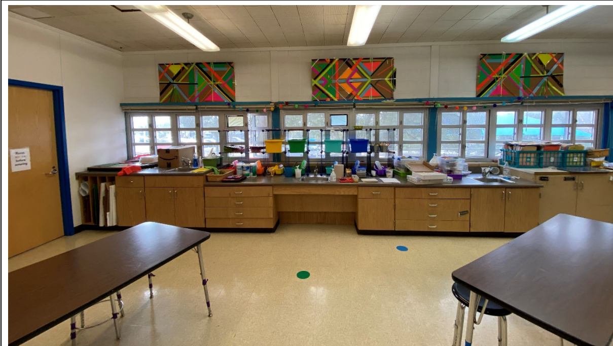
Art studio has plenty of great storage and good natural light. The room appears in newer condition.