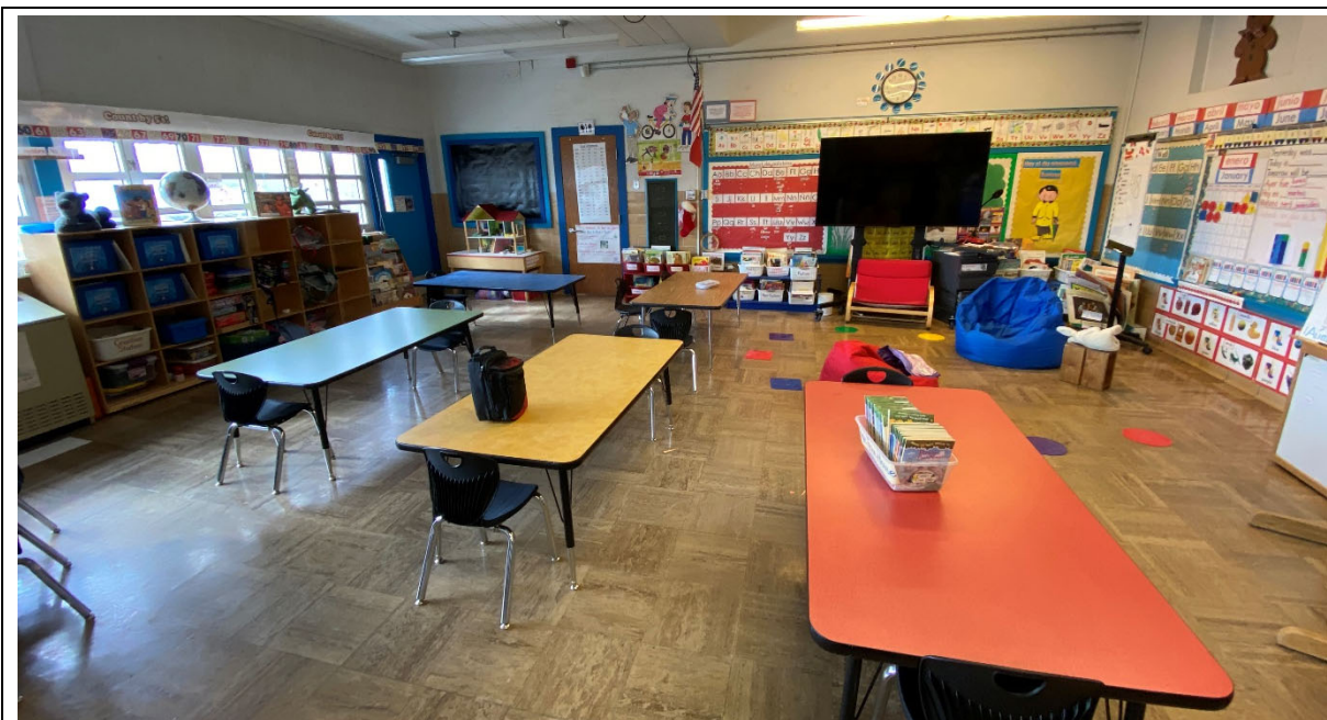
Typical Studio: Space is adequately sized but lacks storage space. Studios receive great natural light.