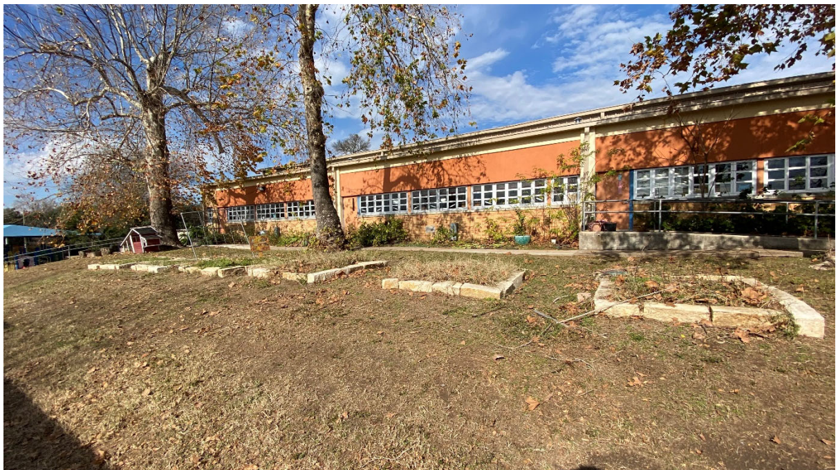
There are many planter beds in similar condition around this central outdoor space. They appear well-used and tended to and are near a water source.