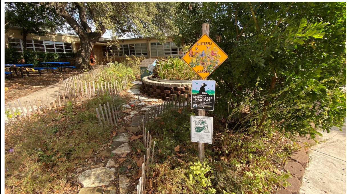
Central outdoor area features a learning pond, butterfly garden and a seating area.