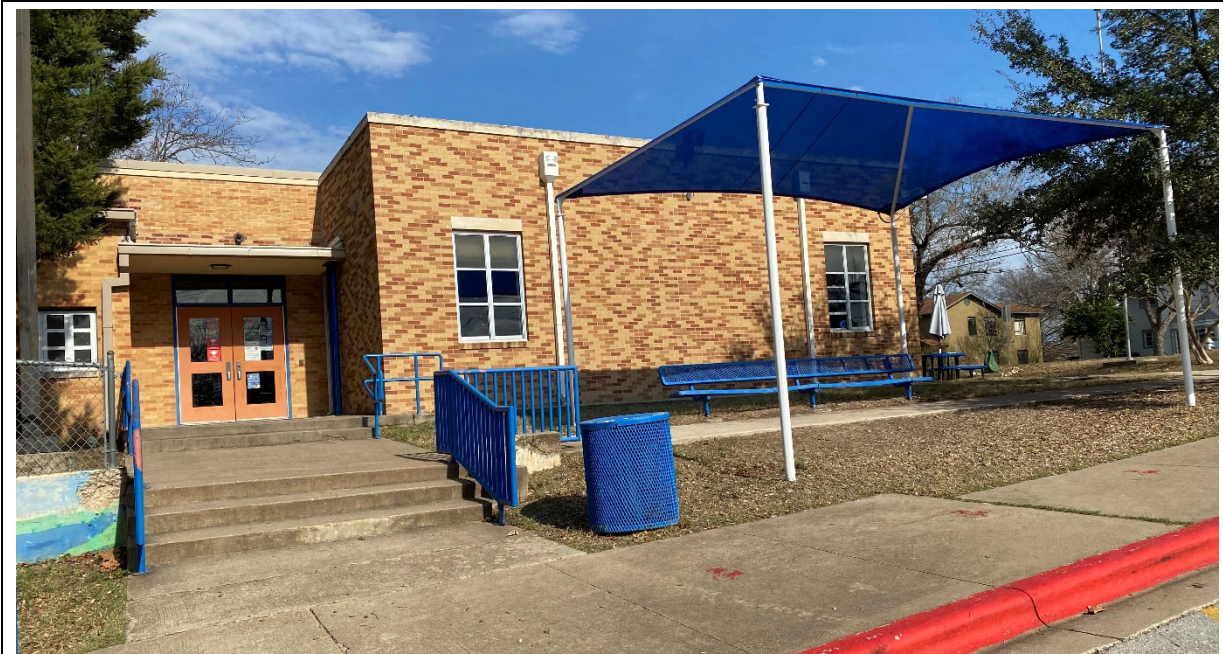
Student drop-off has a covered waiting area but is not located near the main entrance. Queuing space is limited.