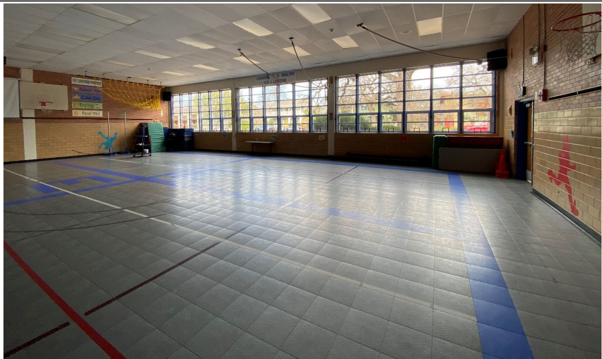
Gym is undersized and the flooring needs renovated. Receives great natural light.