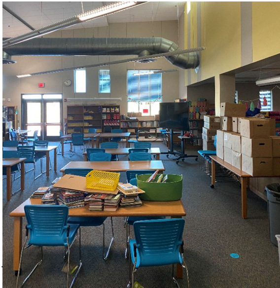
Media Center is in good condition/large size and has a door to the exterior. Currently not in use due to Covid protocols.