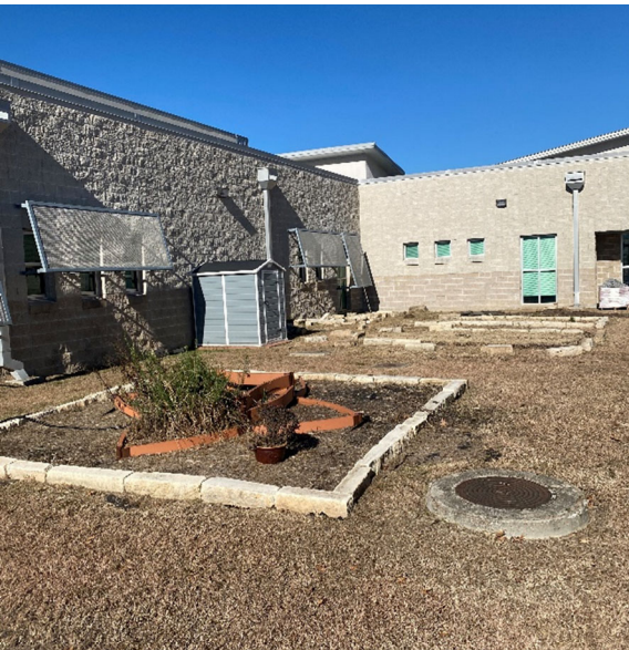
Outdoor gardens and outdoor learning spaces require some updates to function well.