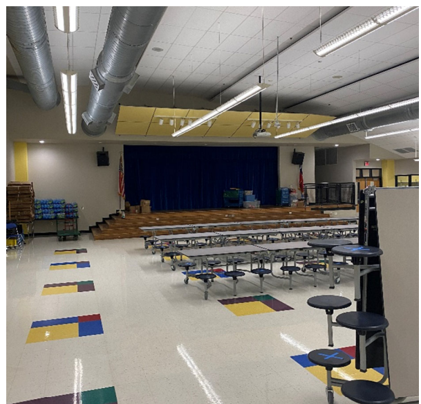
Dining commons is adequately sized. Only provides one type of seating, but in general, finishes and furniture are in good condition.