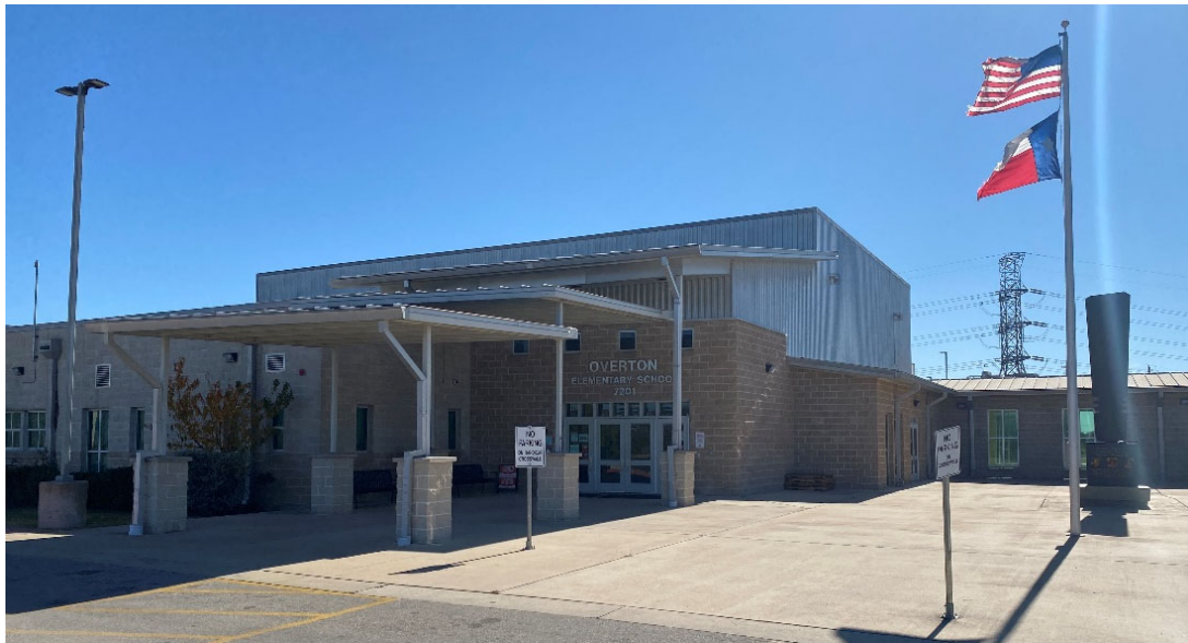
The exterior of the building is in good condition. A monument to community civil rights leaders is a primary feature of the entry courtyard.