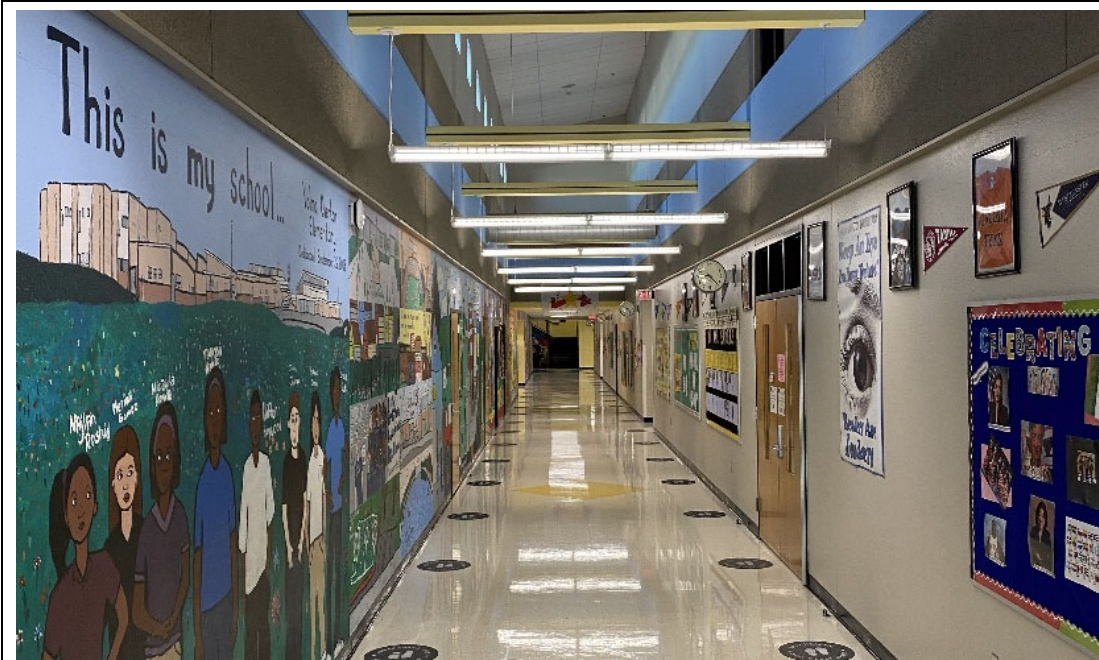
Hallways have ample width. Main hallway conveys school pride with murals and memorabilia on walls.