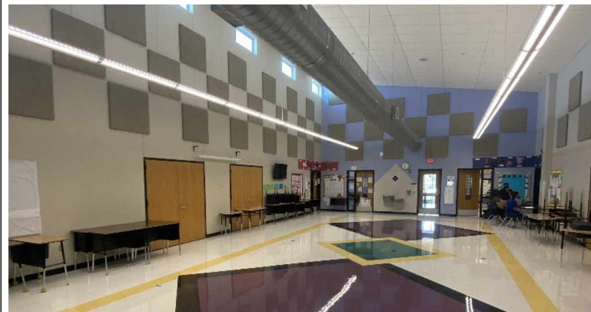
Multipurpose halls in some studio wings provide ample space for collaborative and group breakout learning and gathering of larger groups.