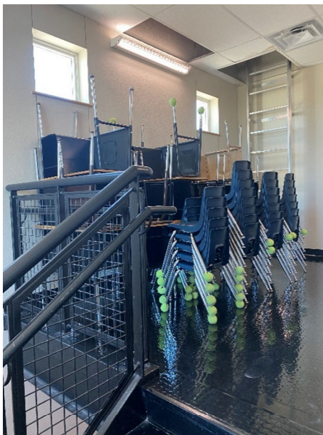
Storage issues are prevalent throughout and may be a function of Covid protocols. Cafeteria storage is also being used for storage.