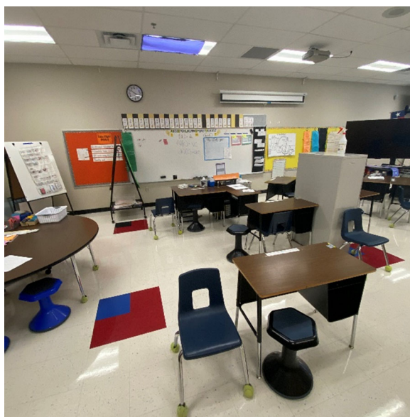
Studios have a mixture of furniture types. Some is updated and flexible while some is not as easily movable and reconfigurable.