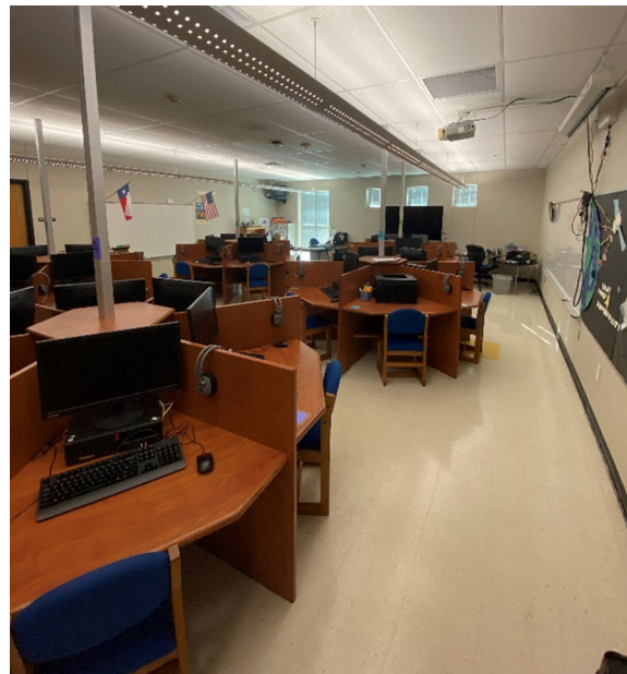
Computer lab and technology learning space needs updates. Power/data poles are being pulled from the ceiling; furniture is dated.