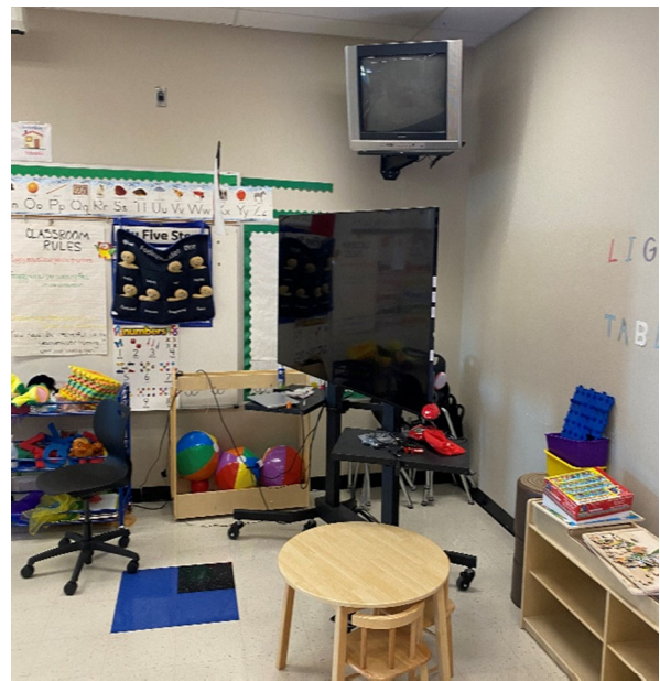
Hardwired technology in studios is out-of-date and mostly unused. Portable screens are preferred.