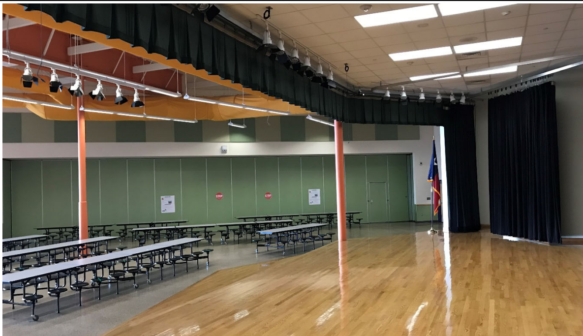
Cafeteria/Stage: Generously sized. Cafeteria opens to gym with folding partition beyond.