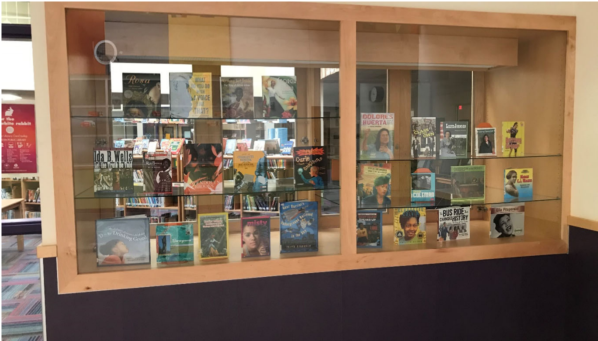
Display cases at the library.