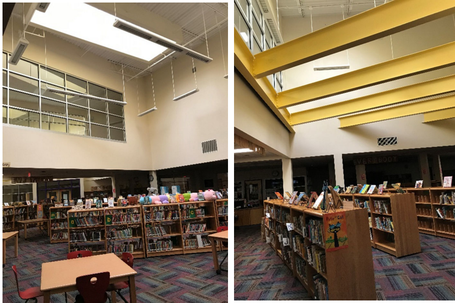
Media Resources: Library is located close to the entry and is a double-height space. Daylight comes in through large skylights.