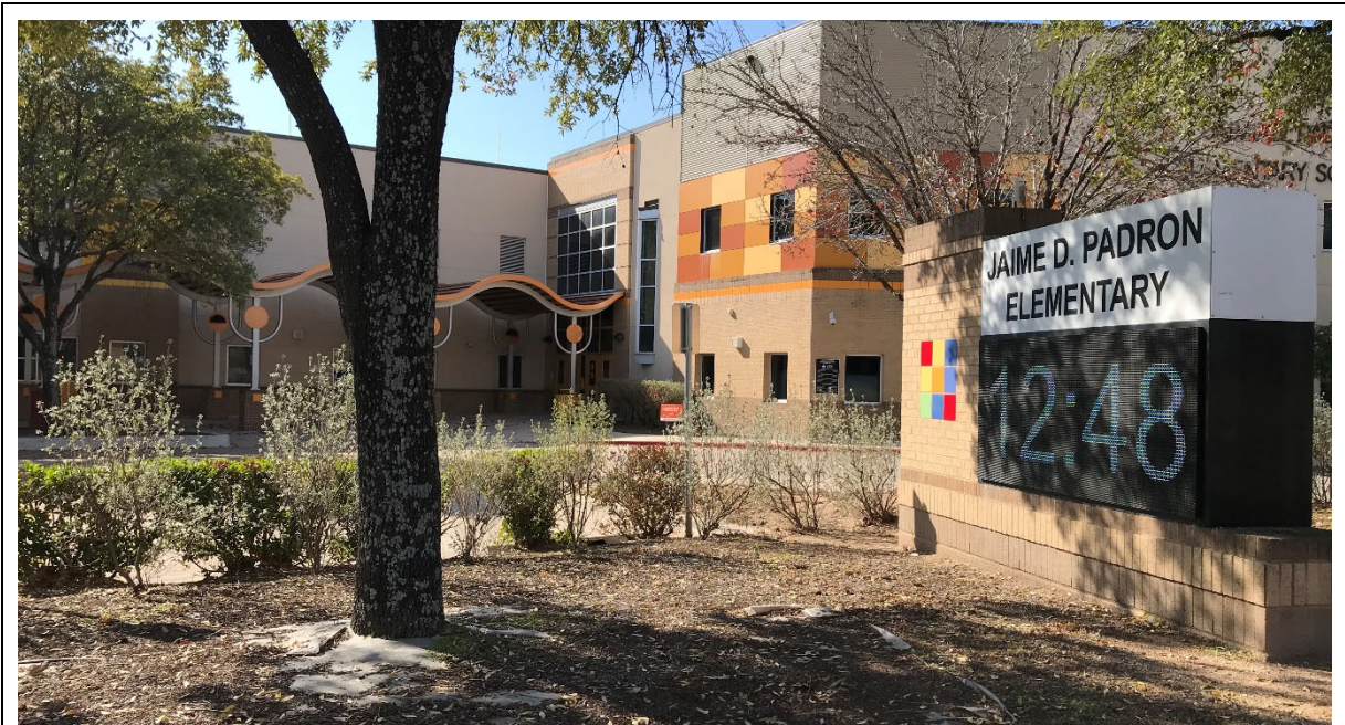
Large digital marquee but site circulation signage is lacking. Exterior of building is in good shape.