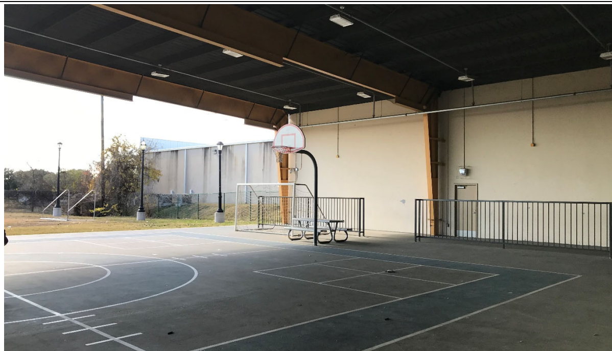
Gym and cafeteria open onto secured outdoor area with playfield and active playgrounds beyond.