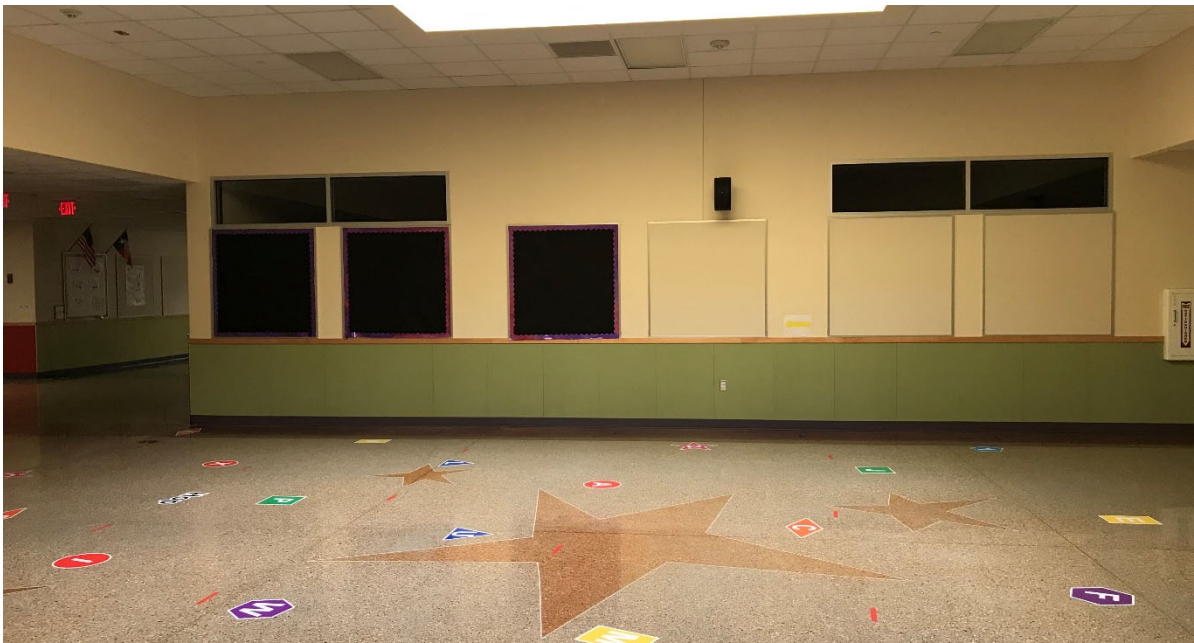
Collaboration spaces outside of studios have daylight and some markerboards and pinup boards but lack of furniture and transparency to the studios makes the spaces underutilized.