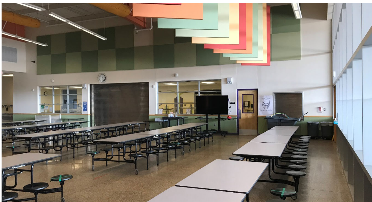
Cafeteria is large, light-filled space and opens to covered exterior space that could provide additional seating.