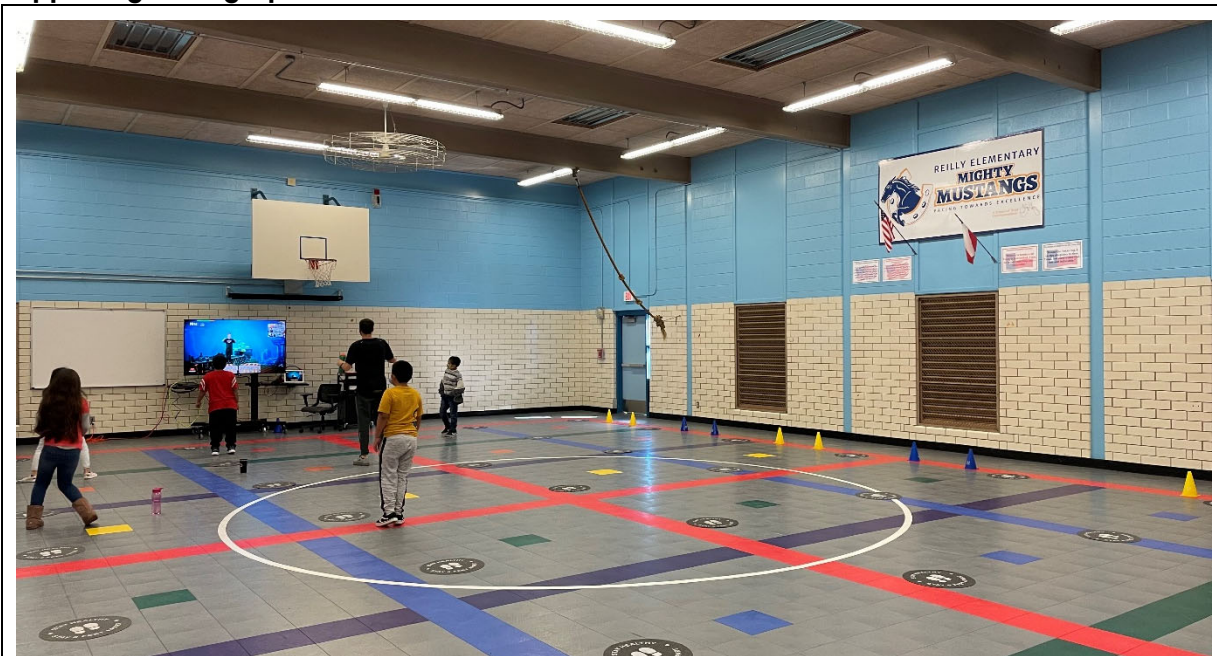
PE and Wellness: The gym is undersized, and finishes are outdated.