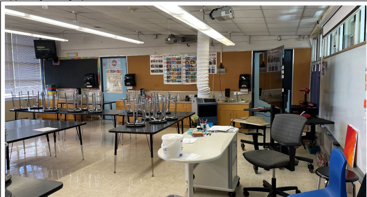
Visual and Performing Arts: Art room is slightly undersized at 900 square feet but has adequate number of sinks. There is a kiln, but storage is limited.