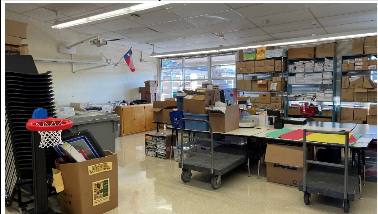
Administration Spaces: The faculty workroom is in a converted studio.