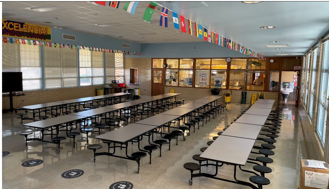
Food Services: The cafeteria is adequately sized for capacity per Ed Spec but does not meet the needs of the school. It is too small for accommodating the entire enrollment at once or hosting large events. The kitchen is very undersized.