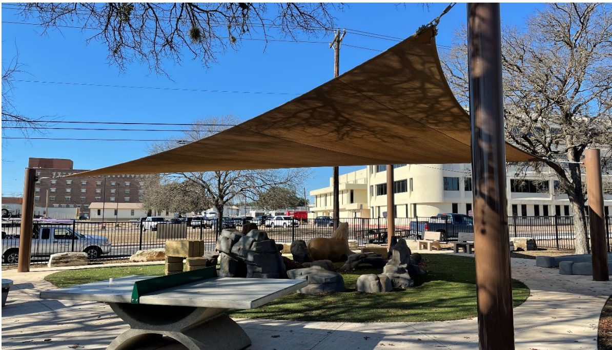
Outdoor Learning and Activity: The school recently added a new playscape. The exterior portion of the campus is quite large due to the adjacency to Reilly School Park. There is a large walking path present as well.