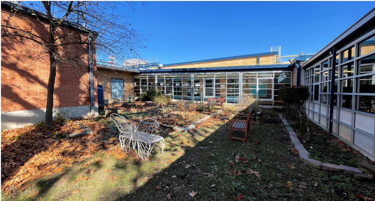
Outdoor Learning and Activity: The school is proud of the new sensory gardens. They are optimally located between studio wings and have access to a water supply.