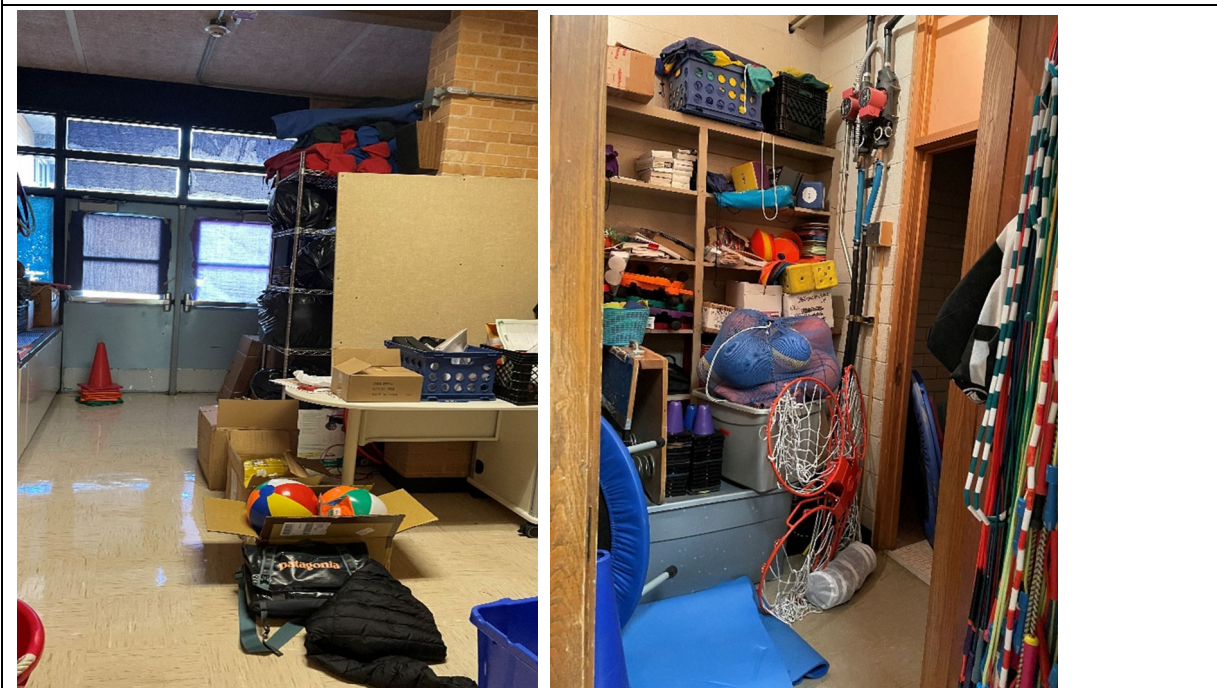
PE and Wellness: The gym storage is detached from the main gym area in what used to be a school entry and restrooms.