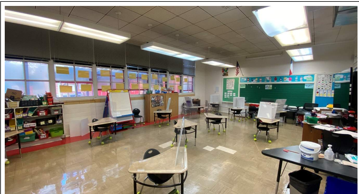
Typical studio with portable screen, built-in cabinetry for storage and furniture that can be reconfigured.