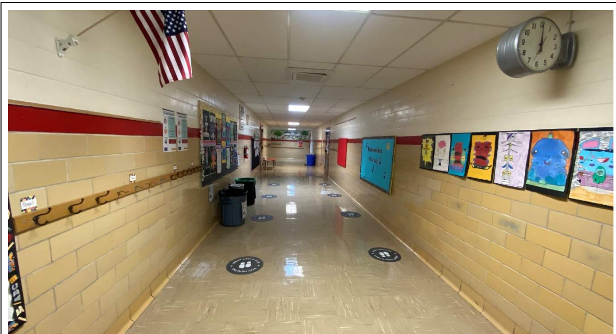
Typical hallway. [REDACTED]