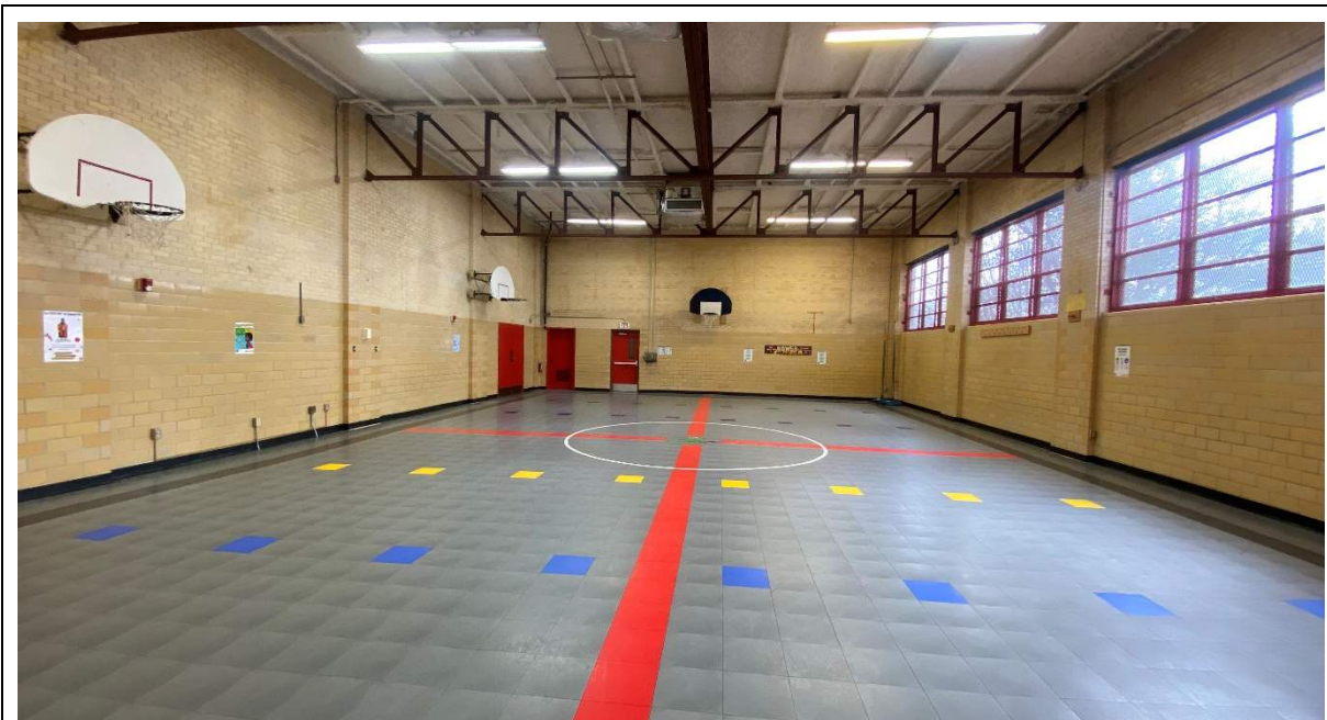
Gymnasium is undersized and has limited storage accessed through a vestibule.