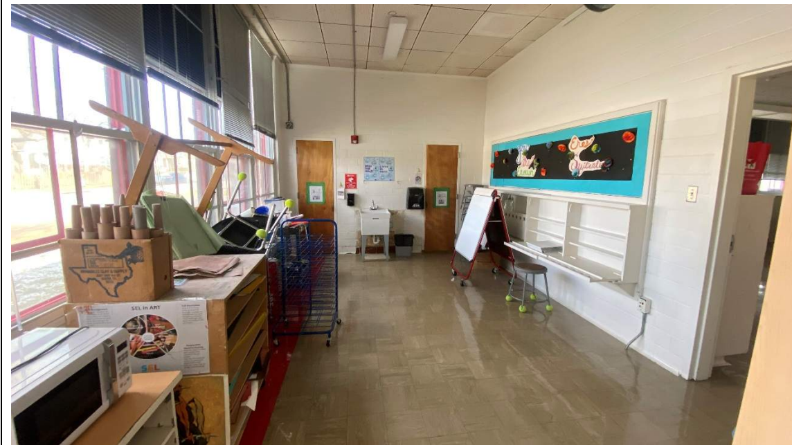
Some studios are joined by a connector space that could be used as small group setting. Restrooms are not ADA accessible.