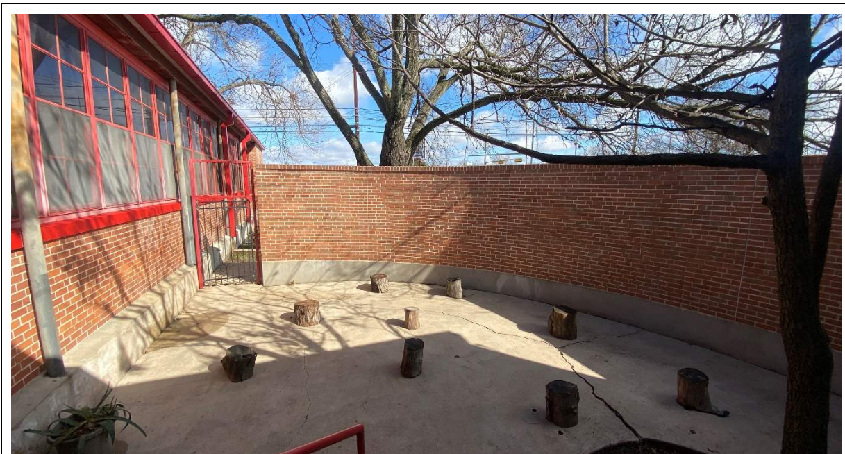
Outdoor studio is accessed through the library. Space is not accessible from library due to steps leading up to the door.