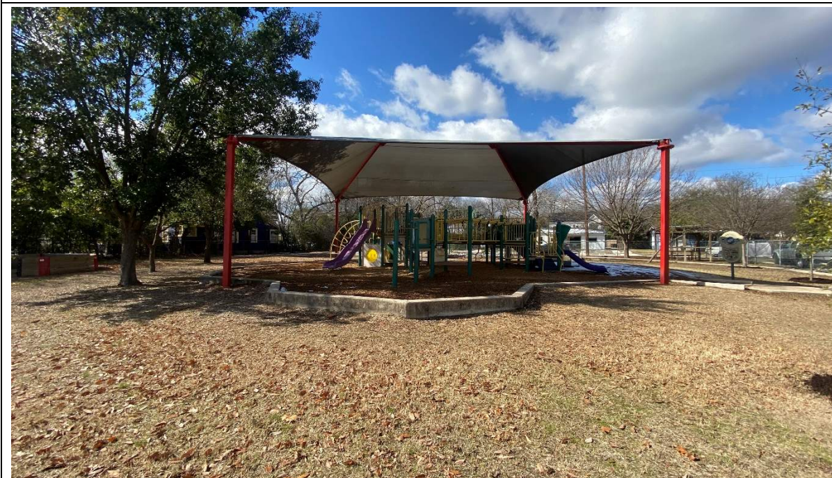
One of two playgrounds. Only one of them is covered.