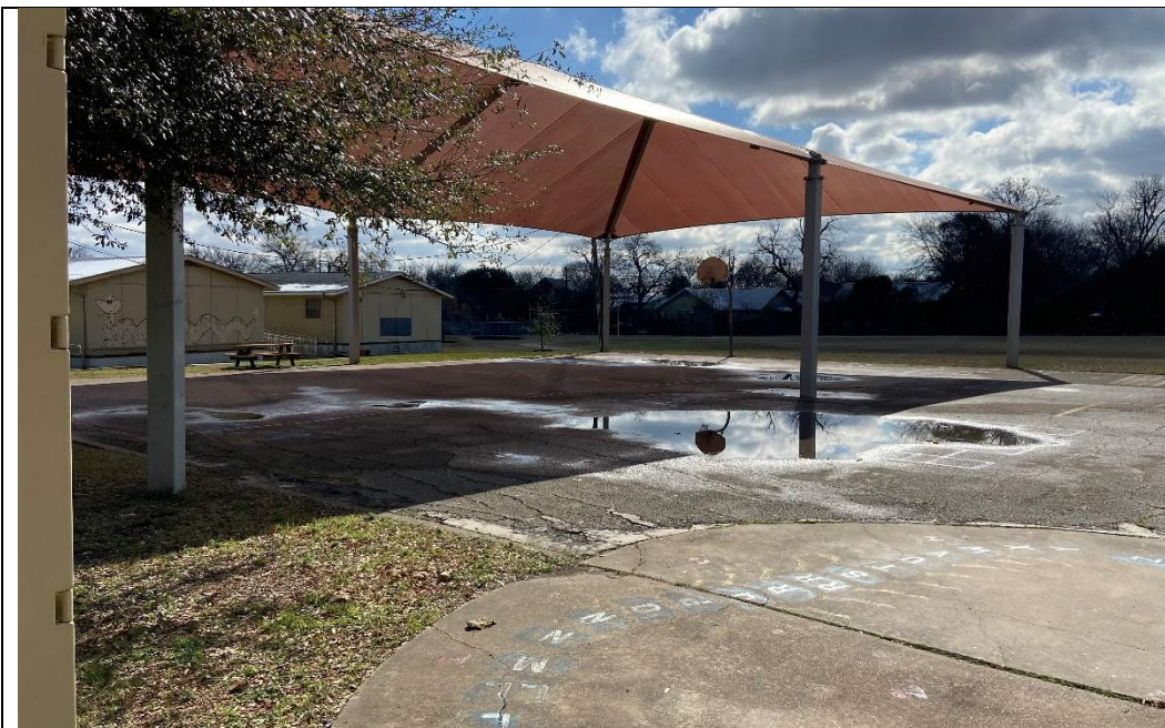
Covered outdoor basketball court adjacent to the portables.