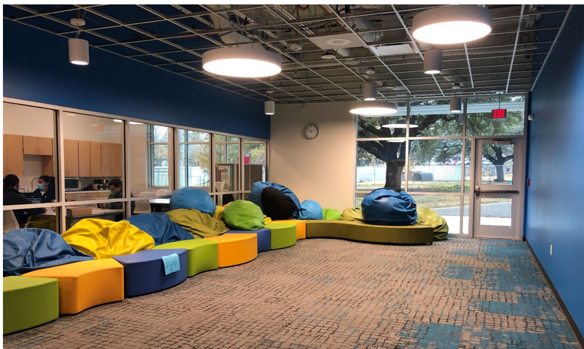
Breakout Space: Breakout spaces are spread across the building adjacent to the main circulation and allow for extra collaboration and learning spaces.