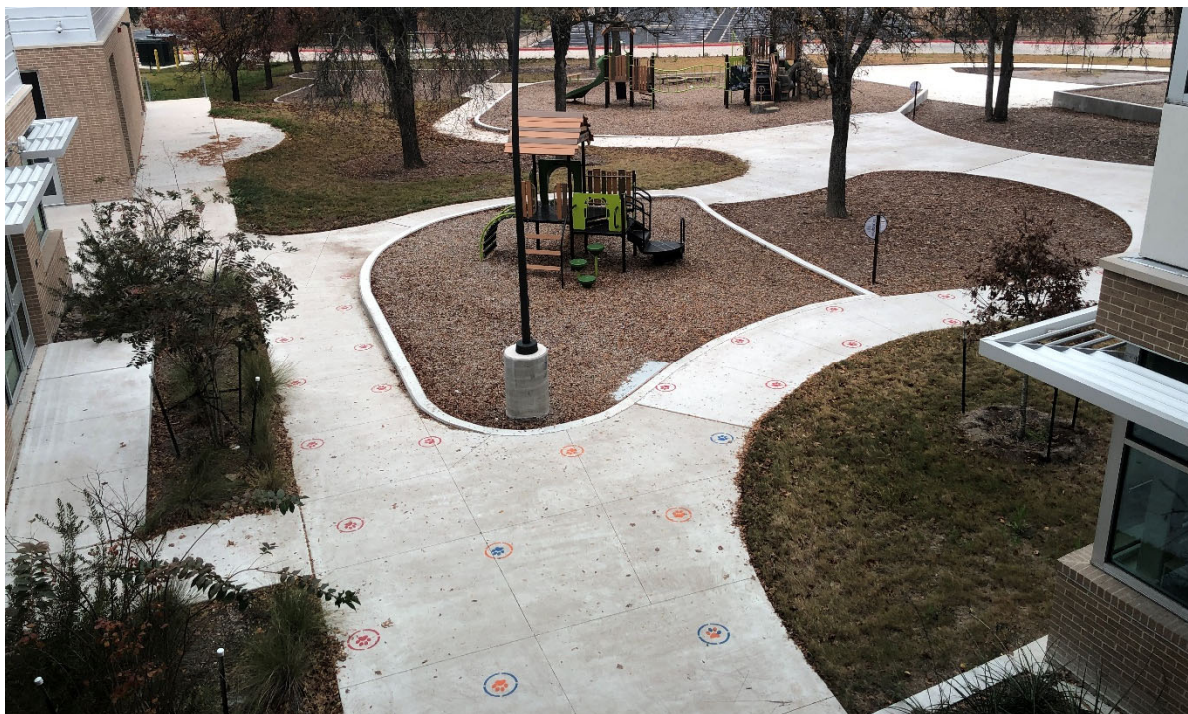
Playscapes: 50% of play areas shaded by tree canopies only.