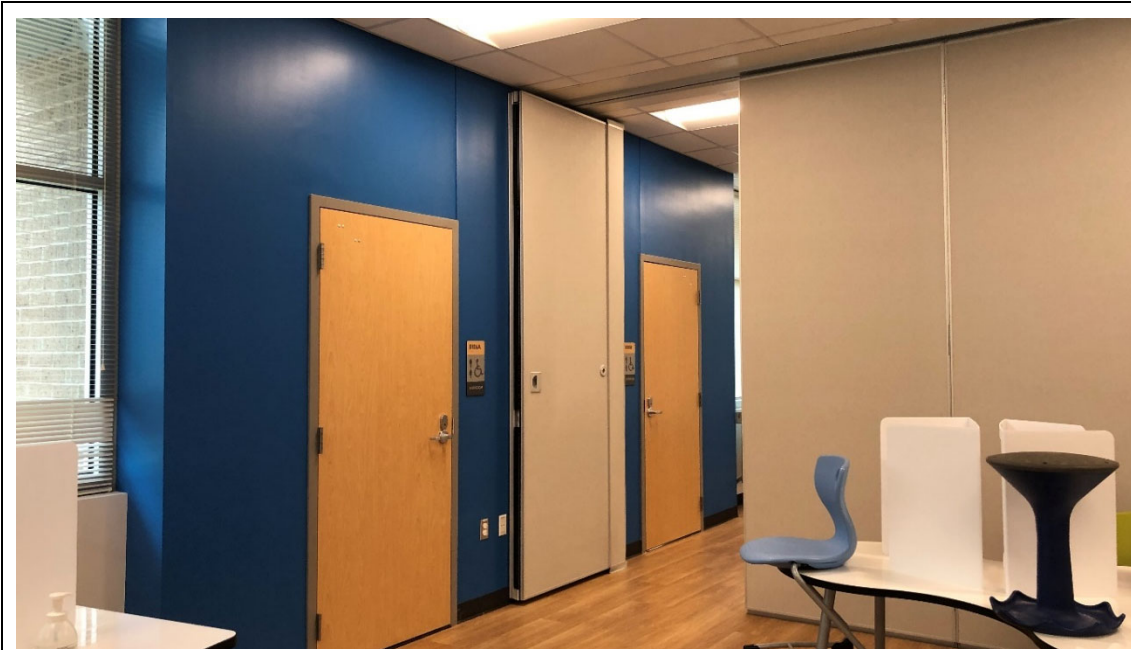
Studio: Movable partition, allows for flexibility and use of restrooms between studios without sacrificing acoustical privacy when needed.