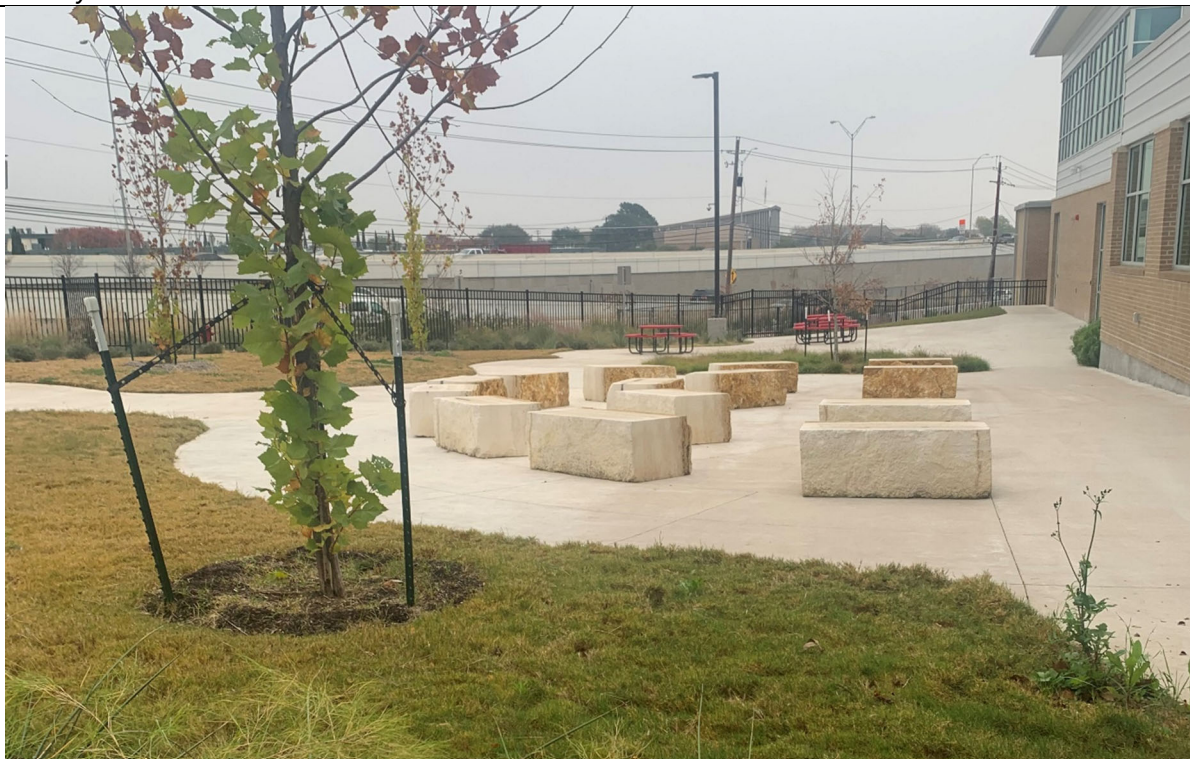
Exterior learning areas are planned with several settings, no shade coverings at most locations.