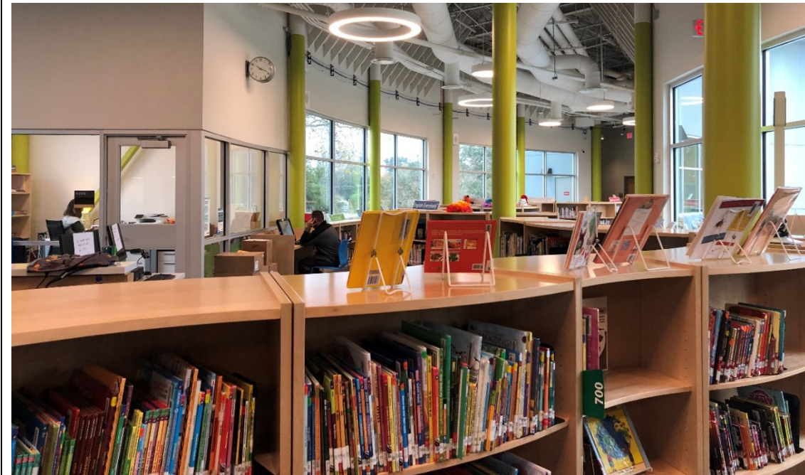
Library: Good natural light in the space. Areas for quiet study are not available. The library is relatively close to the entrance but is on second floor. Outdoor balcony is directly accessed from library.