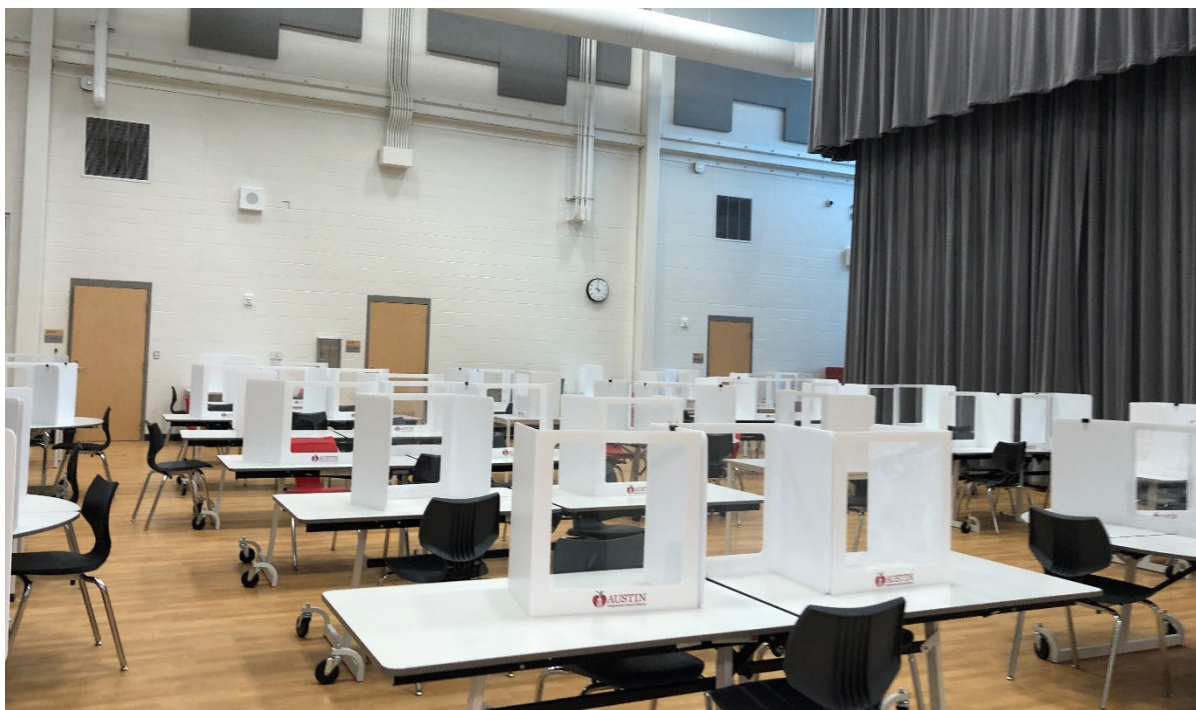
Dining Hall and Stage: Provides multi-use space with operable wall between gym and cafeteria.