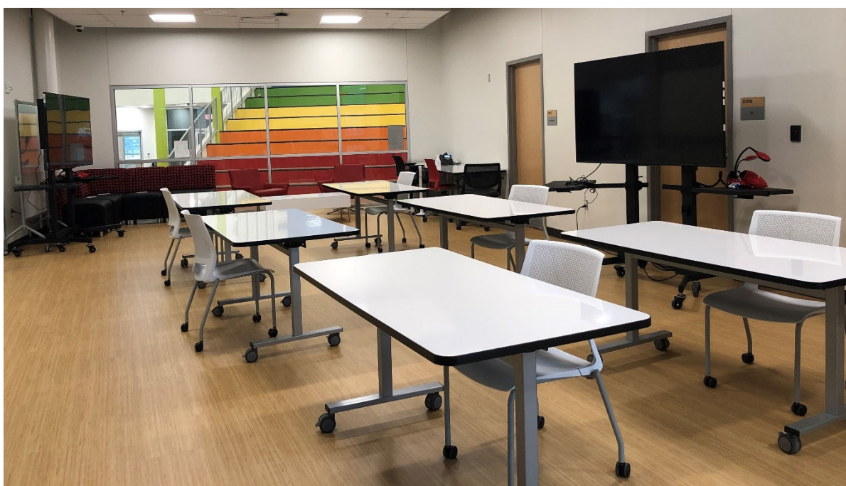
Community Room: Secured separation from the learning areas and afterhours access for a variety of uses