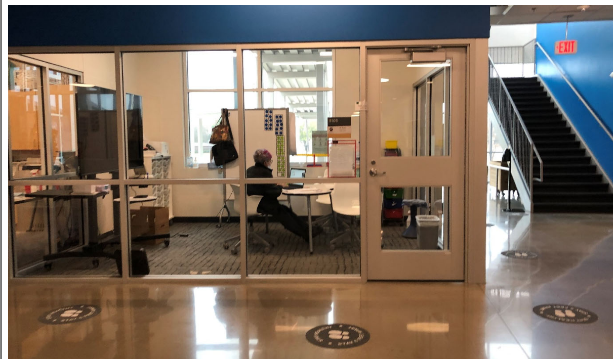
Small Group Space: Good natural light and adequate size.