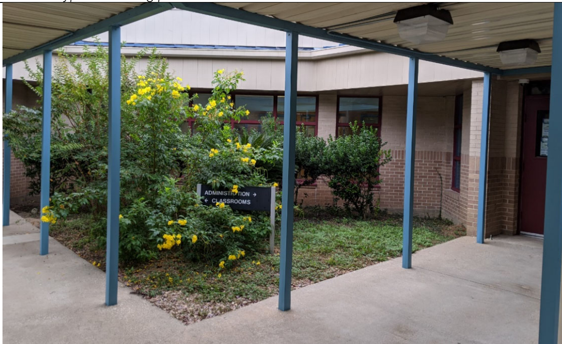
Main entry of school is dark and not welcoming. Signage is obscured, and grounds require maintenance.