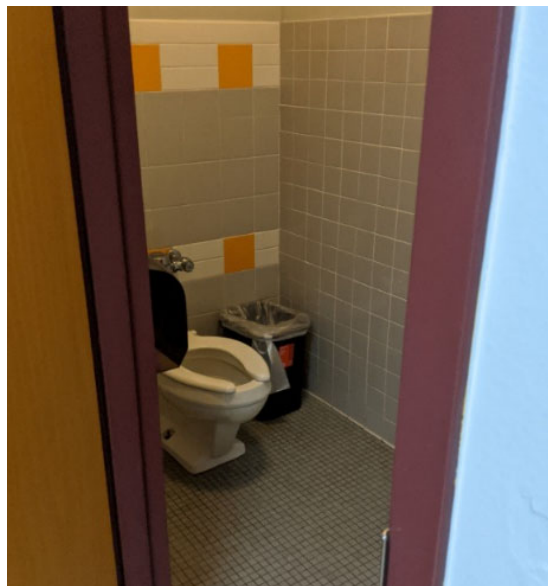
Health services area is inadequate and undersized. Inaccessible toilet and no storage.