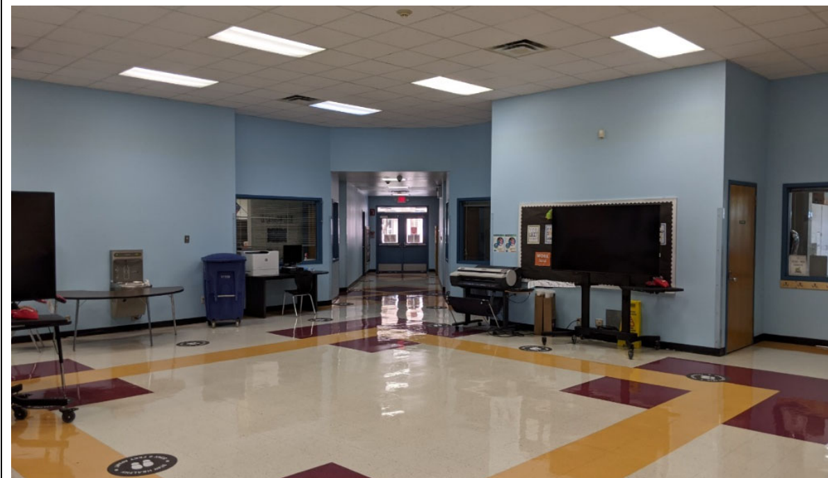
Collaboration space in studio pods. Storage room/restrooms block visibility from studios into collaboration space. These spaces are underutilized due to this issue.