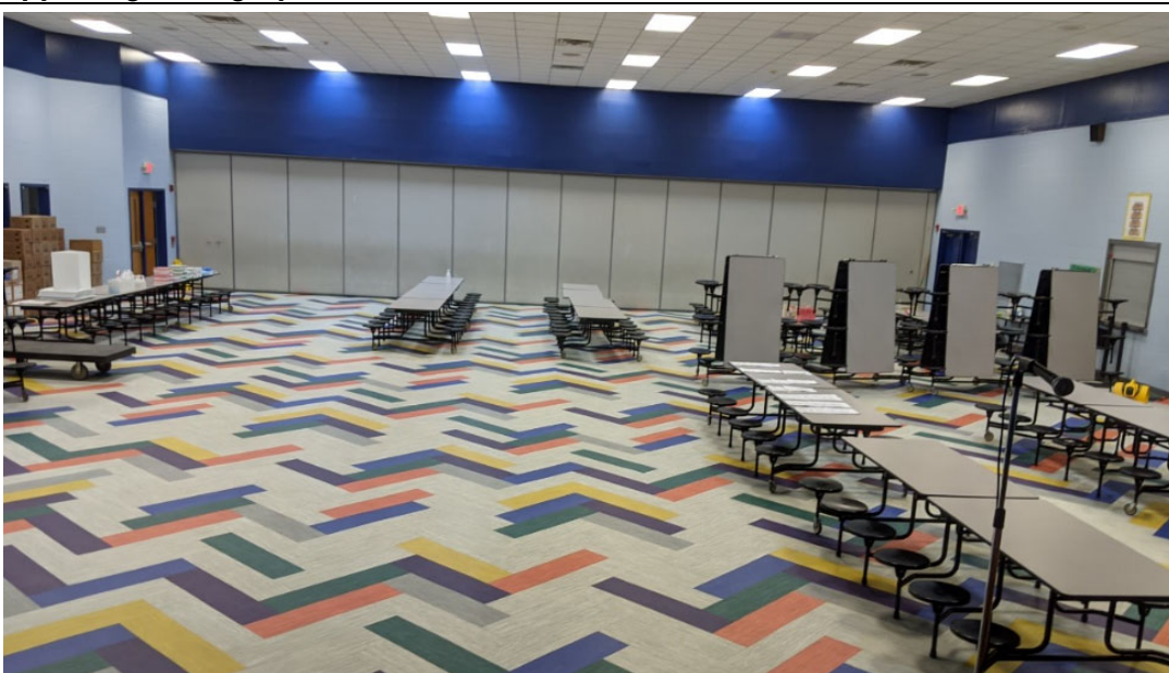
Movable partition between gym and cafeteria creates acoustic issues. No natural daylight in gym or cafeteria. Flooring is in good condition.