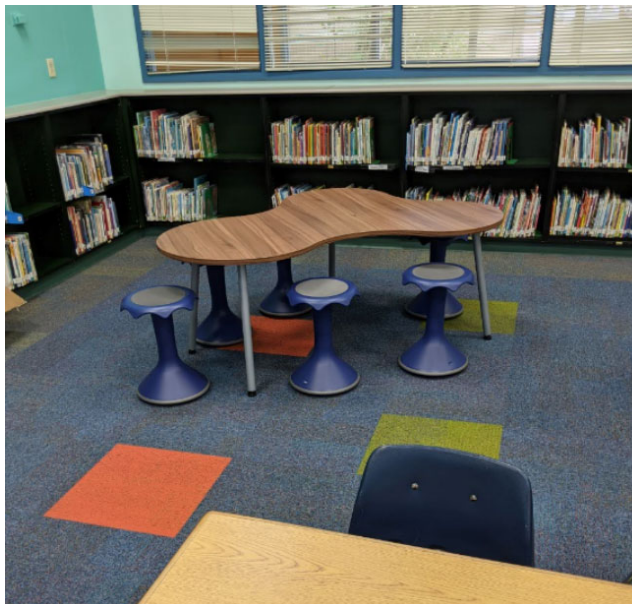
Media Resources: Natural daylight only from overhead. Limited transparency into corridors. Different types of seating provided..