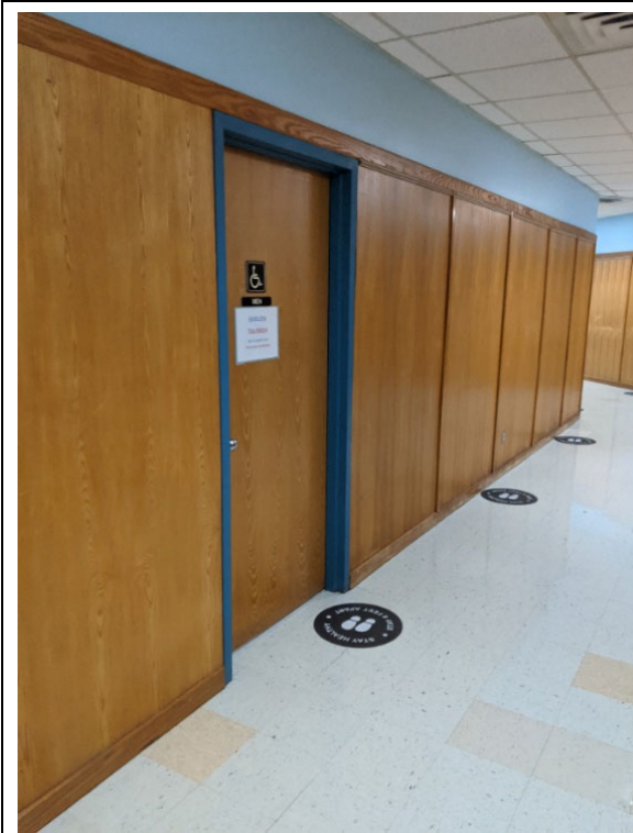
Dark wood paneling is not conducive to an elementary school environment.