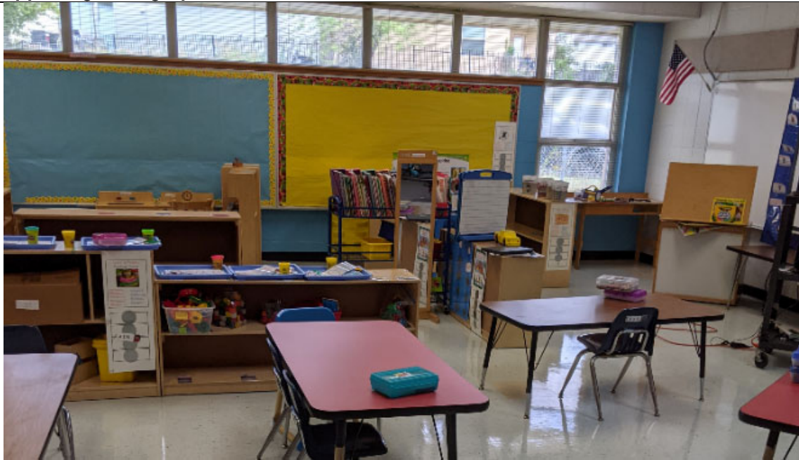
All studios have access to natural daylight. Studios do not meet current SF requirements according to Educational Specifications.