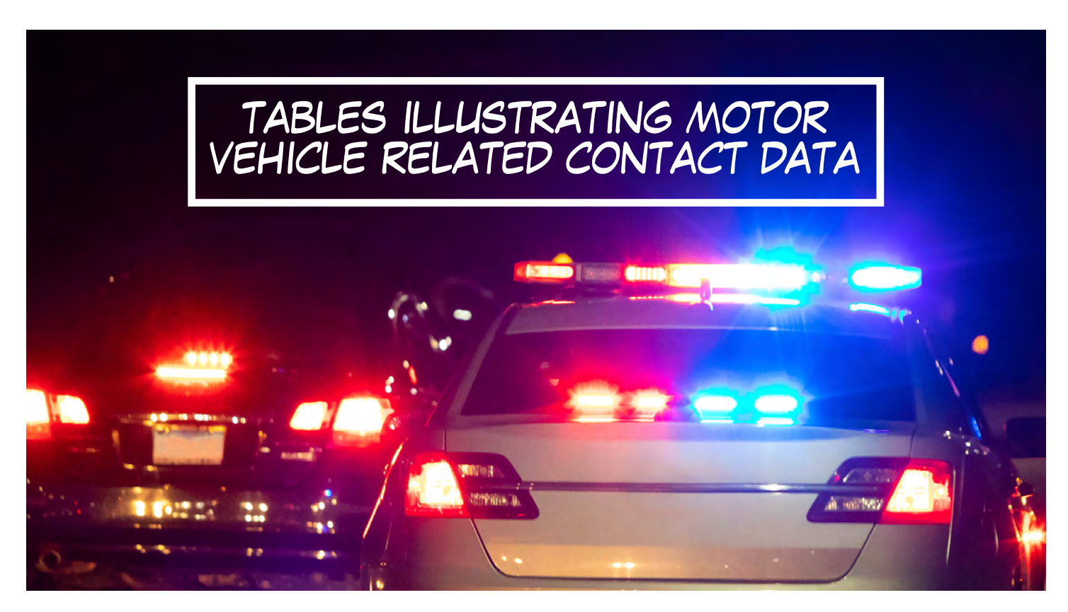
Table 1. Citations and Warnings